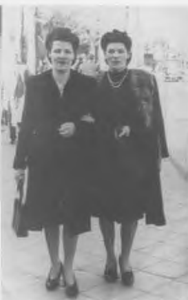
With one of her sisters in Madrid, 1945.

of one. She believed that it is possible to be happy here on earth, by teaching more and more people about caring for the home, which is crucial because that is where people develop their personalities.