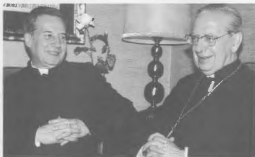
Monsignor Echevarría and the future Blessed Alvaro del Portillo

John Paul II and John XXIII were truly fathers close to all the faithful, to the Church, and particularly, I can say, to this part of the Church which is the Prelature of Opus Dei. I think they helped millions of people to feel that they were the Pope's "much-loved sons and daughters."