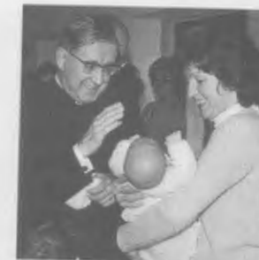
St Josemaria Escriva