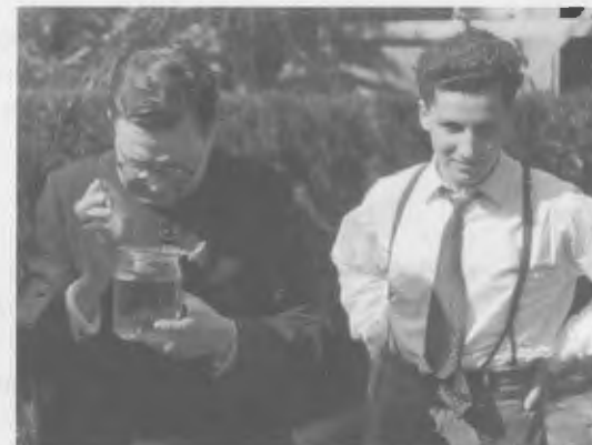
Josemaria Escriva with Javier Echevarría in Rome, 1950

March 27, 2011. The director Roland Joffé traveled to Rome to present his film on St. Josemaria Escriva at the Vatican. The film takes place during the Spanish Civil War. Among those in attendance, were those who knew St. Josemaría before he died in 1975.