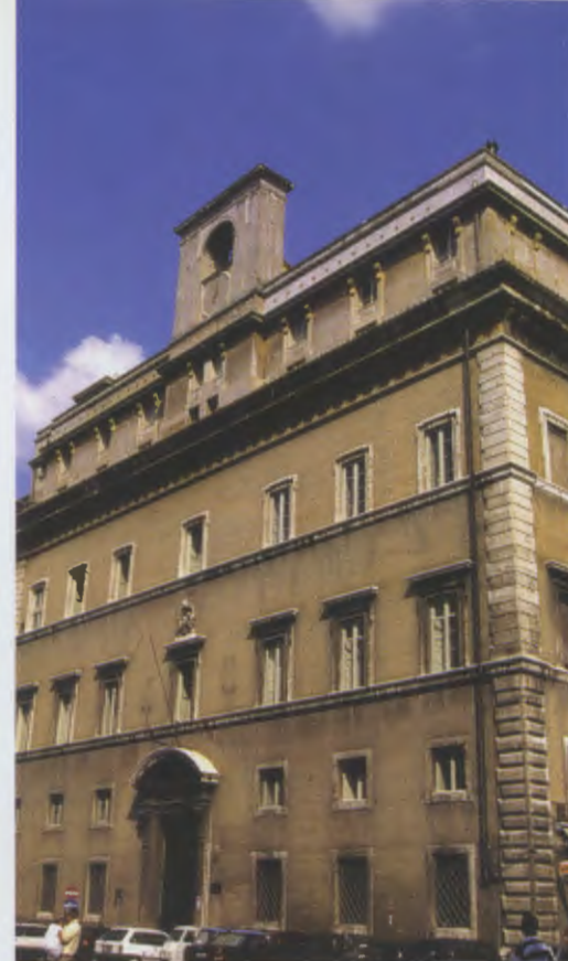
• The Apollinare Palace seat of the Holy Cross Pontifical University.

"Without their help, great or small, which is always the fruit of love for God and veneration for the priesthood, we would not be able to carry out the good that is being done in service of the Church," Bishop Javier Echevarría, Prelate of Opus Dei, said recently in regard to those who assist the university financially.