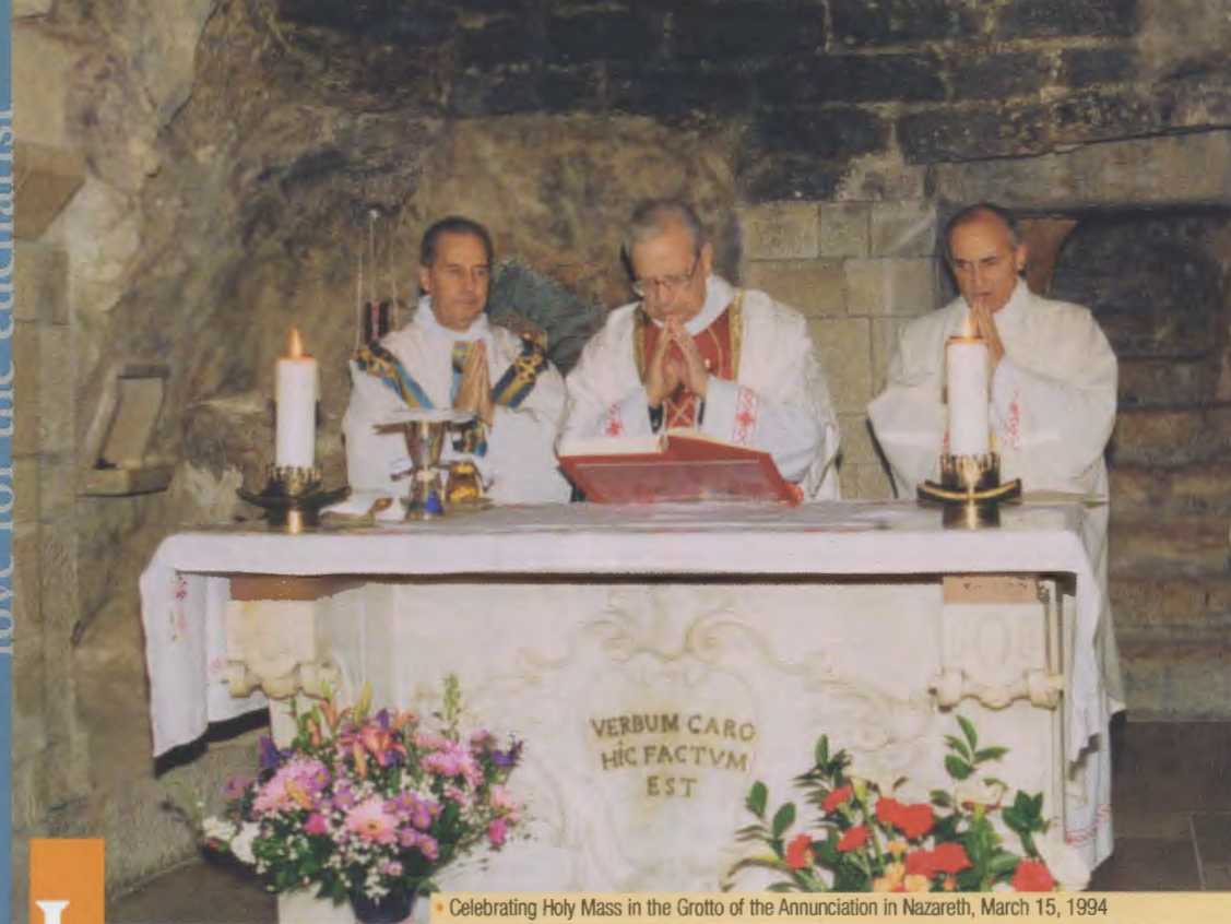
• Celebrating Holy Mass in the Grotto of the Annunciation in Nazareth, March 15, 1994