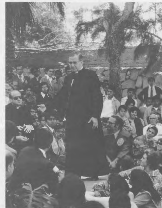
Blessed Josemaria in a family get-together in Peru on July 29, 1974.

A week later, his notes reveal glimpses of Blessed Josemaria's intense prayer life, showing us the path of love by which the Holy Spirit was leading him: " qui facit voluntatem Patris mei. . . , ipse intrabit in regnum caelorum . O that I too might do your will! I want to do it: from now on, this is what I will ask those who pray for me to request."