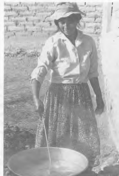
Twice a week, they take care of 1700 children in 22 villages. Shown here is a meal being prepared

The gathering was a catechesis that went directly to the foundations of Christian life. "Don't be satisfied just with material things. . . . You should want, in the first place, to live a Christian life, to come closer to Jesus each day, as I want to. Do you know how we get closer? By using the means that he has provided: getting to know his teaching and receiving his sacraments." 2