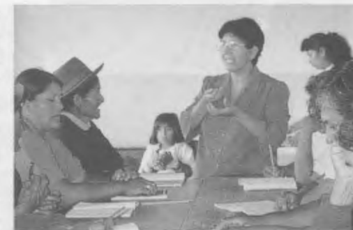
Condoray's literacy classes have reduced the level of illiteracy in the Valley of Cañete to well below the 51% national average for village women.

In 1963, with the encouragement of the Founder of Opus Dei, Condoray began its activities. At that time it was only a small school in which classes in handicrafts, sewing and cooking were given. A little later, in 1965, it began to offer technical training classes with official accreditation. In 1981 the programs were expanded, and Condoray became a Special Center of Professional Training, where one could take courses in secretarial studies, hospitality services, tailoring, and in the health services and food industries. Thanks to the professional training, illuminated by a Christian outlook on life, provided at Condoray, many women in the Valley of Cañete have been able to improve their