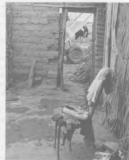
In the rural areas of the valley of Cañete, 70% of the homes are of thatch or adobe and lack basic facilities.

The work of social and Christian development carried out by Condoray has spread beyond Peru's borders. Since 1985, students from Canada, England, Germany, Ireland, France, Belgium and Spain have come to work in the villages of Cañete. This help is fitted into the framework of the programs carried on throughout the year. The university women who participate give the villagers classes in nutrition, first aid, tailoring and cooking. And they don't go home with empty hands: they discover the greatness of Christian joy and optimism in the face of adversity. They learn that the people of this valley have real virtue in their lives, and that wealth is much more than just simple material well-being. They have seen a Christianity lived in a coherent way.