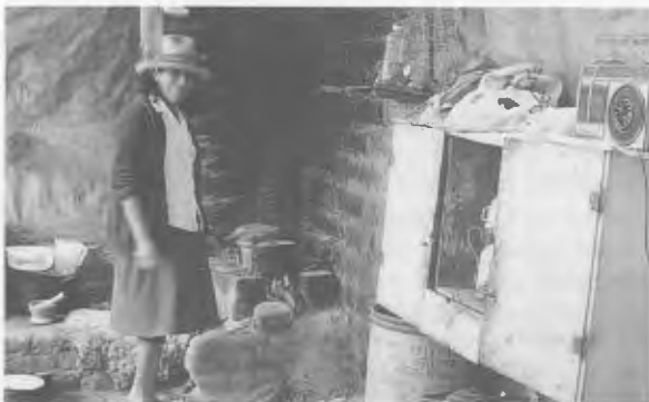
Interior of a home in a rural village.

A key to all of this development has been the role of rural promoters who receive their training in Condoray and then become, in turn, educators of others.