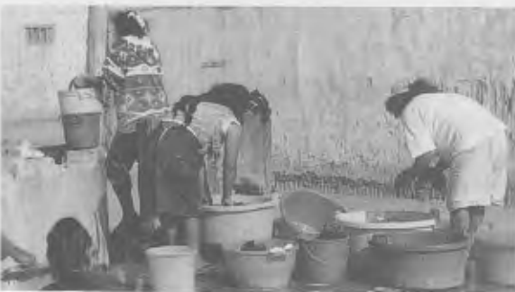
Improving living conditions for village women—some 80% of whom lack health services, water or sewers—is another program of Condoray.

In Cañete the results of the initiative and teachings of Blessed Josemaria Escriva are noticeable. In August of 1974, a little more than ten years after the beginning of work there, the Founder of Opus Dei traveled to Peru to undertake an intense catechesis. At a gathering in the valley on July 13, there were a great number of village folk from communities throughout the area. It was a mosaic of races: angular faces burned by the sun of the Andes, whites and mestizos, mulattos, and people of Asian features. The first words of Blessed Josemaria were: "I have come to congratulate you on the great work of human development that you are doing here. I say 'human development' for a reason; it is not only professional or material formation, it is also spiritual development." 1