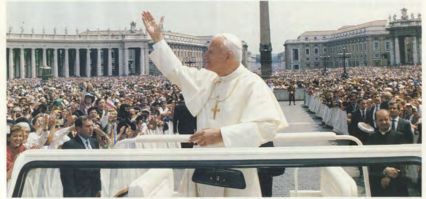
Pope John Paul II before the audience of May 18, 1992, being acclaimed by the pilgrims.