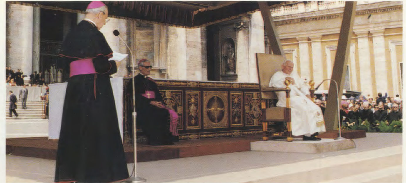
Bishop Alvaro del Portillo, Prelate of Opus Dei, greets the Holy Father at the beginning of the Audience of May 18, 1992

Christ, Mary, the Pope: three names intimately united in the heart of Blessed Josemaria, who wished to sum up his apostolic zeal in that aspiration he so often repeated, and which we too, now, once again make our own: Omnes cum Petro ad Iesum per Mariam! — all, with Peter, with the Pope and in the Church, to Jesus through Mary! Amen. □