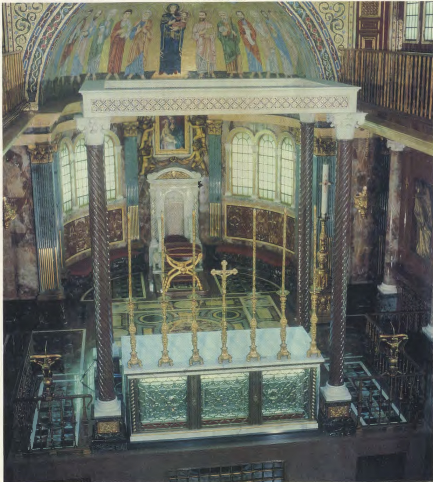
Altar of the prelatial church of Our Lady of Peace in Rome with the casket containing the sacred body of Blessed Josemaria Escriva