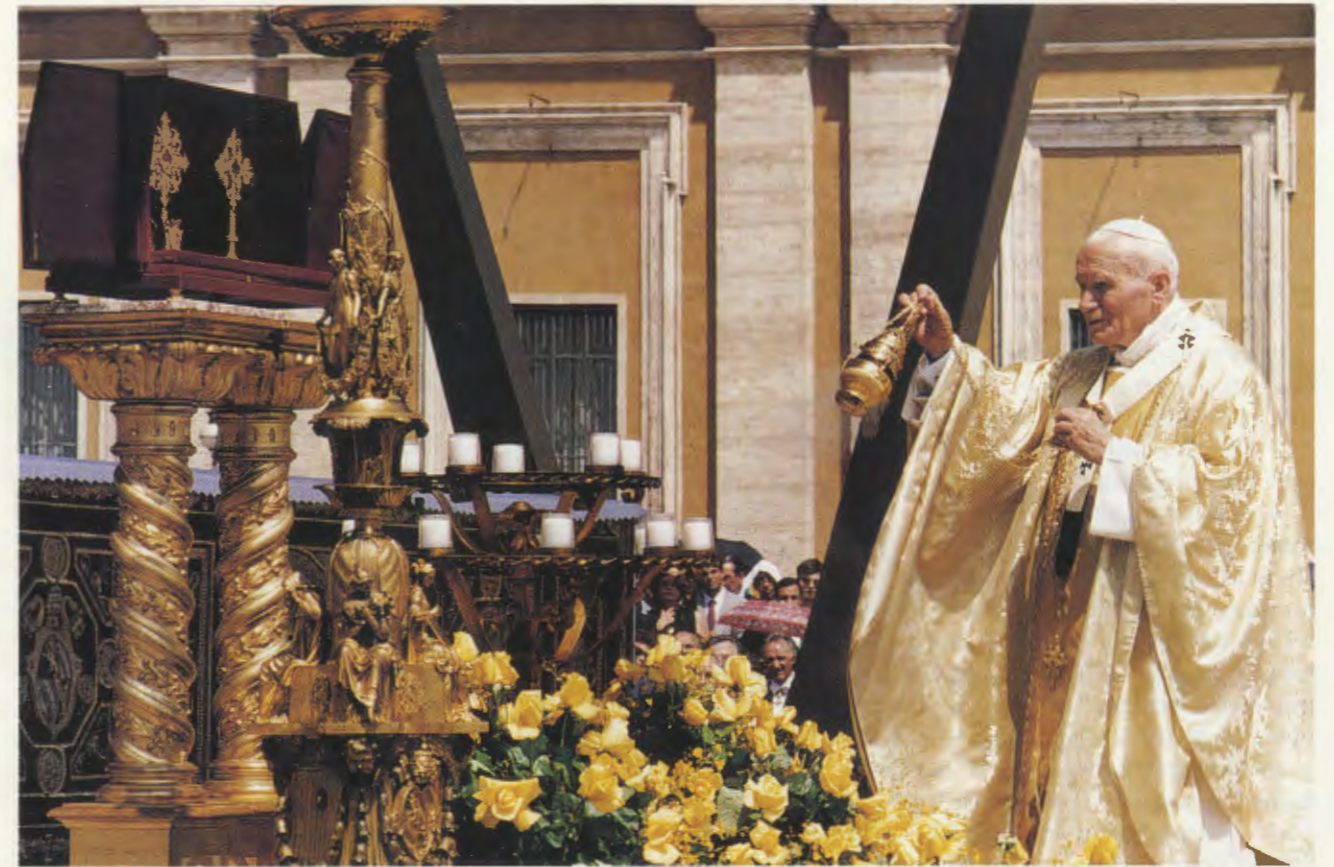
His Holiness, Pope John Paul II, during the incensing of the relics of Blessed Josemaria and of Blessed Josephine Bakhita.

That commandment was at the center of the