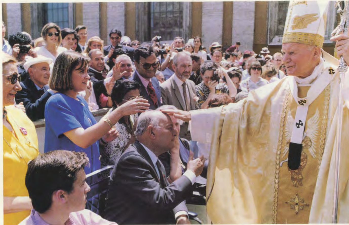
The Holy Father greets the sick who attended the beatification ceremony near the foot of the altar.