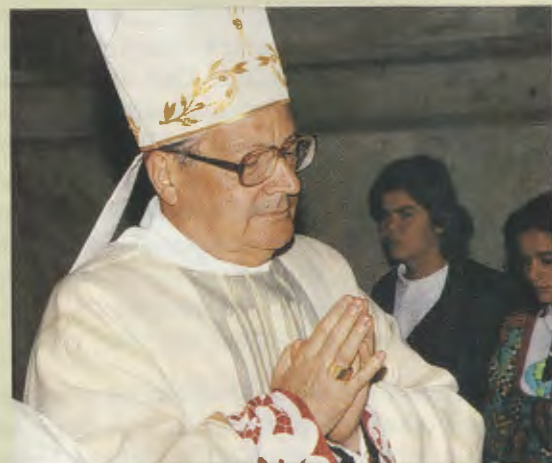
Cardinal Angelo Sodano Secretary of State to His Holiness

Holy Father, on this day when, through a happy coincidence, we are celebrating Your Holiness' seventy-second birthday, and renewing my full personal adhesion and that of all of the Prelature of Opus Dei to the Holy See, allow me to offer you our congratulations with the classical Latin expression, which I would like to be an invocation to Our Lord and His Most Blessed Mother: ad multos annos! Then, after thanking Your Holiness once again from the bottom of my heart, I ask, for me and for all those who are joyfully taking part in the beatification of Josemaria Escriva, to be strengthened by your Apostolic Blessing. □