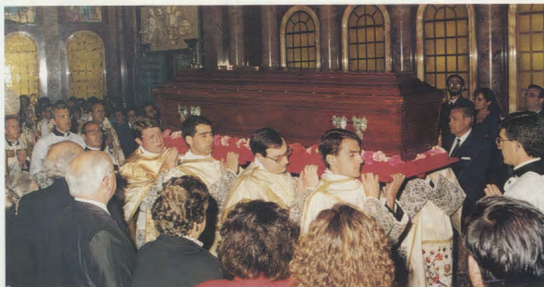
May 21, 1992: Procession in the prelatic church of Our Lady of Peace, where the holy remains of Blessed Josemaria Escriva rest

before the glass case which was draped with a red cloth. The extension of the private devotion to the Founder of Opus Dei is universally accepted. The Pontifical Decree on the heroicity of his virtues defines it as "a true phenomenon of popular piety." This was made especially manifest at the beatification. People of all ages, from the most diverse countries and social backgrounds, gathered together in an orderly and silent fashion, so as to give thanks for favors obtained through his intercession, and to ask him for help with the spiritual and material needs that are always present in the lives of men and women.