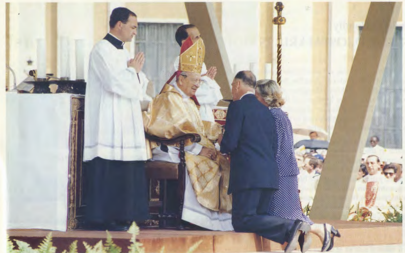
Bishop Alvaro del Portillo during the offering of the gifts in the Mass of Thanksgiving held in St. Peter's Square on May 18, 1992

And as she was the causa nostrae laetitiae , cause of our joy, so may we in turn strive to be Mary's joy, so that we may join her, the Queen of Heaven, in our blessed homeland. □