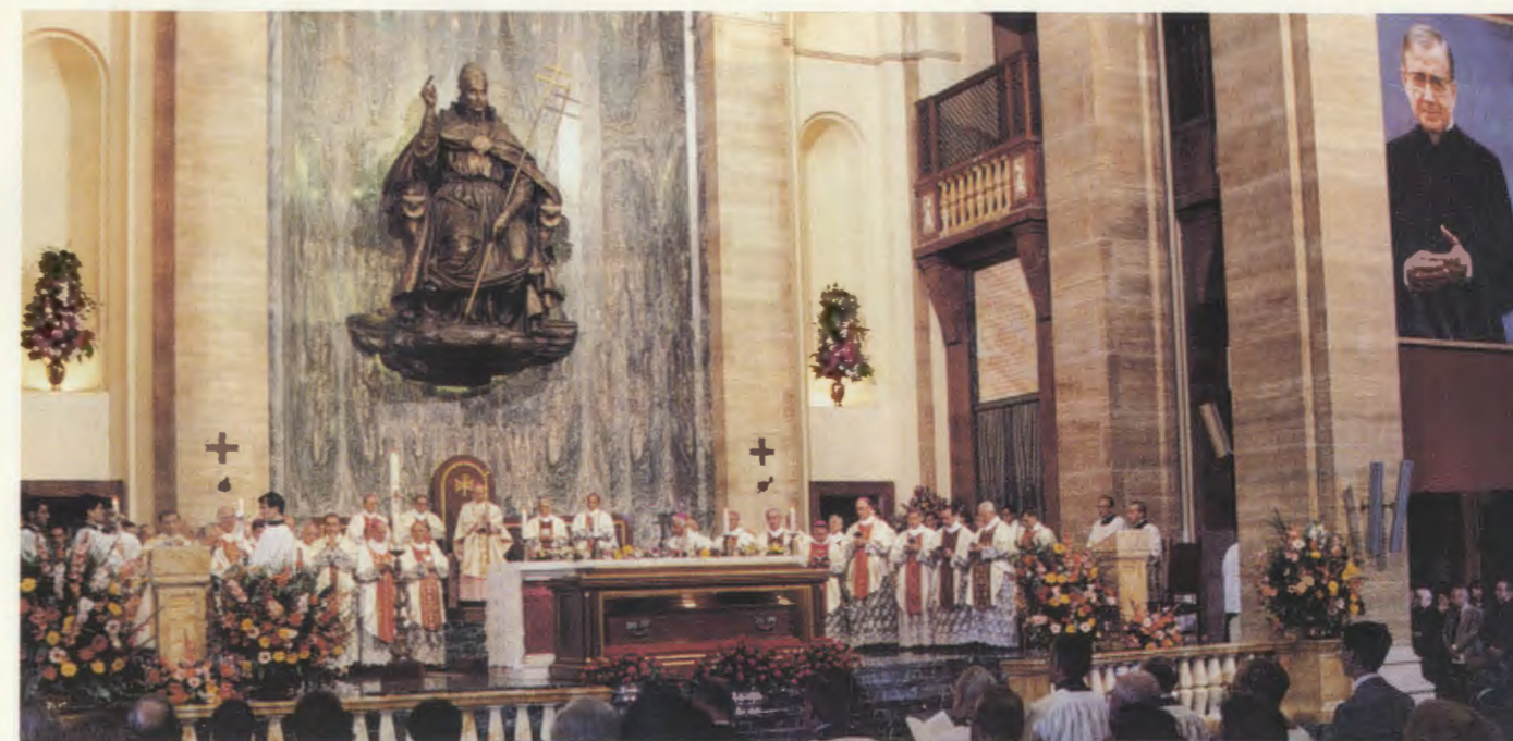
The Prelate of Opus Dei, with a group of bishops and priests, during the solemn concelebration in thanksgiving in the Basilica of St. Eugene on May 21, 1992

Cardinal Pietro Palazzini celebrated a Mass in Latin for groups from various countries in the Basilica of St. Andrea della Valle. Cardinal Angelo Rossi, Dean of the College of Cardinals, said Mass in the same church, in Portuguese. Cardinal Johannes Willebrands, former President of the Pontifical Council for the Promotion of Christian Unity, did so in Dutch in the Basilica of St. Clement. Cardinal Andrzej Maria