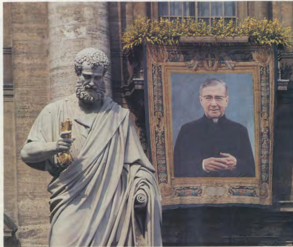
Portrait of Blessed Josemaria Escriva, displayed on the facade of St. Peter's Basilica, immediately following the beatification on May 17 and on May 18