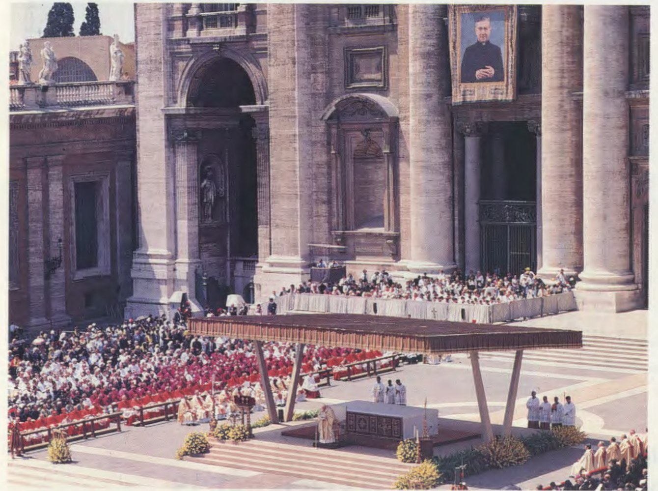
The Holy Father during the homily of May 17, 1992.

Archives of the Secretary of State, no. 304,722