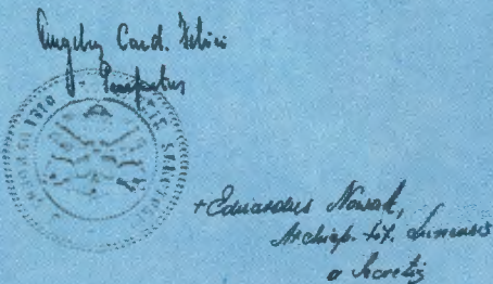
Concluding page of the original Decretum