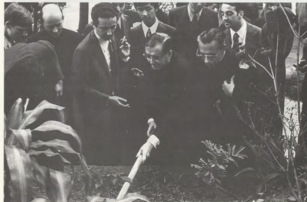
Monsignor Josemaria Escriva in Sitio de Aroeira, a center of Opus Dei in Brazil, 1974.

"All who had the privilege of knowing him can testify that when he died in 1975, at the age of 73, he was so young! He had not grown old with the passage of time. On the contrary, his spirit had grown younger year by year, with an incredible vitality of youthfulness and cheerfulness: born in no easy fashion but over a lifetime of heroic struggle which brought him closer to God day by day" ( Opus Dei in Africa: a Force for Good , in the Sunday Nation , Nairobi, 2/3/80).