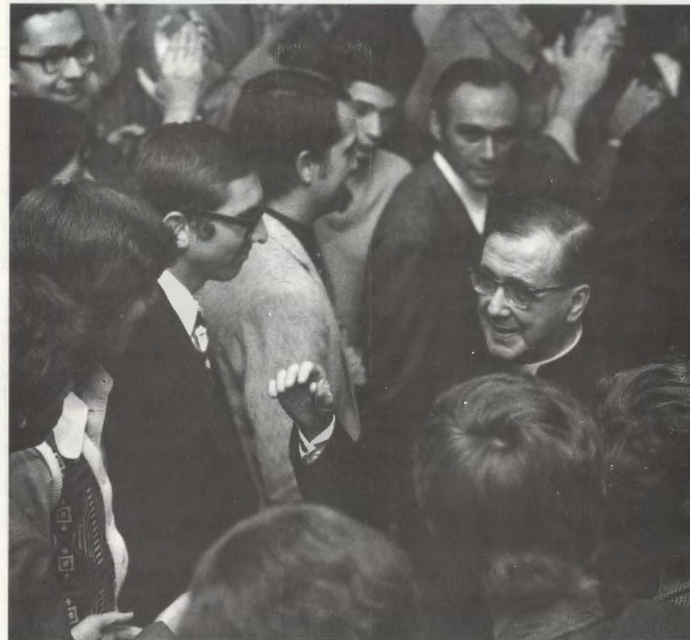
Monsignor Josemaria Escriva after an informal gathering in Sao Paulo, Brazil, 1974.