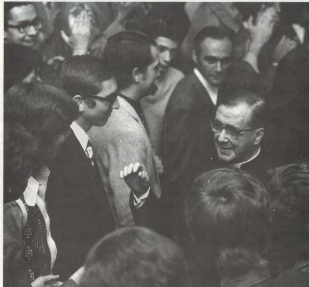
Monsignor Josemaria Escriva after an informal gathering in Sao Paulo, Brazil, 1974.