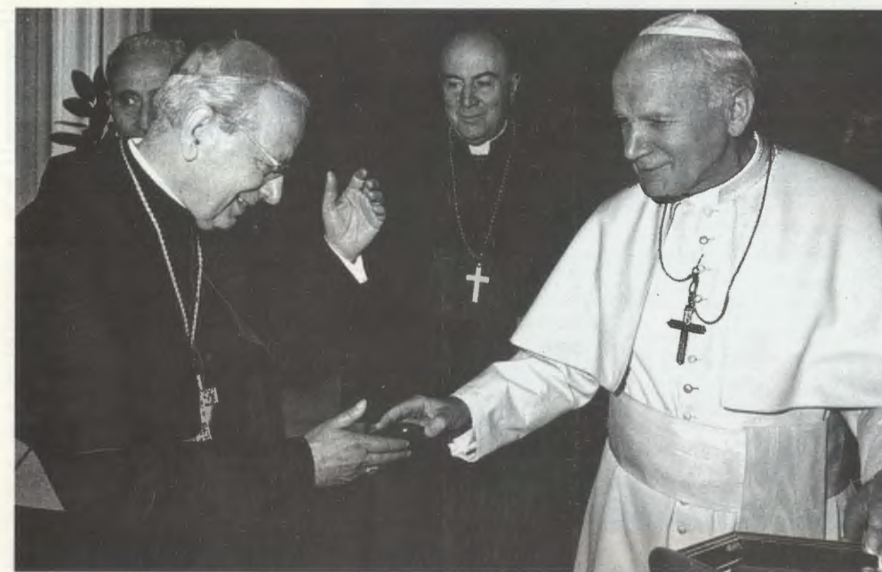
The Holy Father Pope John Paul II with Angelus Cardinal Felici, the Prefect of the Congregation of Saints, and Monsignor Alvaro del Portillo, the Prelate of Opus Dei, after the declaration of the heroic virtues of the Venerable Josemaria Escriva on April 9, 1990.

In 1946 the Servant of God took up residence in Rome. In 1947 and 1950 he obtained Opus Dei's approval as an institution of pontifical right. With tireless charity and active hope he guided the development of Opus Dei throughout the world, promoting a vast mobilization of lay people who became aware of their personal responsibility in the Church's mission. He gave life to numerous initiatives in the work of evangelization and human welfare. Everywhere he fostered vocations to the priesthood and to the religious life. He carried out exhausting journeys through Europe and America, proclaiming the Church's teaching with most vigorous faith. Above all he devoted himself tirelessly to the task of forming the members of Opus Dei — priests and laity, men and women — so that they would acquire a solid spiritual life, an exemplary adherence to the Church's magisterium, and an ardent zeal for souls expressed in a personal commitment to carry out a far-reaching apostolate. Omnes cum Petro ad Iesum per Mariam! "All with Peter to Jesus through Mary!" was the aspiration tirelessly preached and practiced by the Servant of God from the beginning of his priesthood.