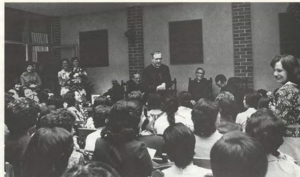
Msgr. Escriva with members in a training center for women in Guatemala in 1975.