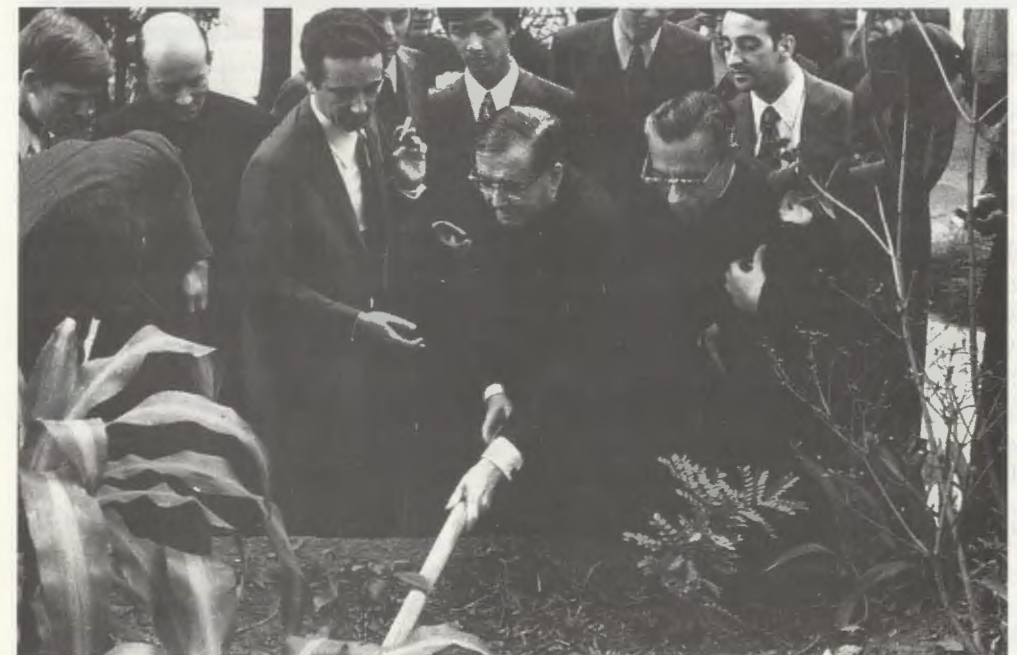
Monsignor Josemaria Escriva in Sitio de Aroeira, a center of Opus Dei in Brazil, 1974.

"All who had the privilege of knowing him can testify that when he died in 1975, at the age of 73, he was so young! He had not grown old with the passage of time. On the contrary, his spirit had grown younger year by year, with an incredible vitality of youthfulness and cheerfulness: born in no easy fashion but over a lifetime of heroic struggle which brought him closer to God day by day" ( Opus Dei in Africa: a Force for Good , in the Sunday Nation , Nairobi, 2/3/80).