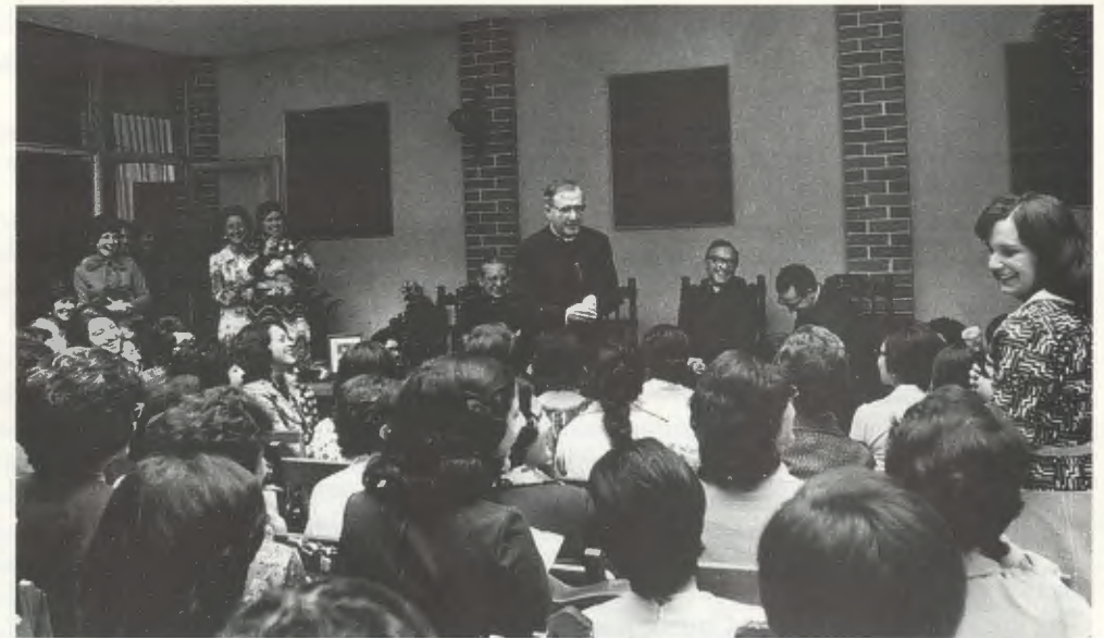
Msgr. Escriva with members in a training center for women in Guatemala in 1975.