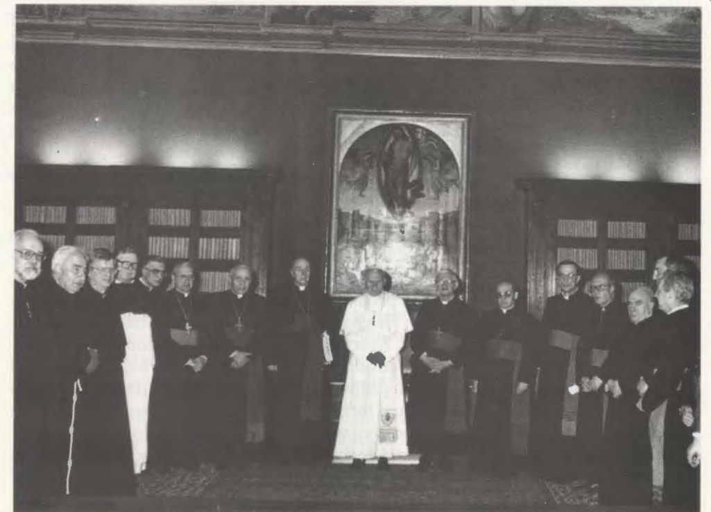
After the reading of the Decree of the heroic virtues of the Venerable Josemaria Escriva.

The Servant of God was born in Barbastro, Spain, on January 9, 1902, of devout and God-fearing parents. At about the age of fifteen he began to notice signs of his vocation. Although he did not know exactly what God had in store for him, he decided