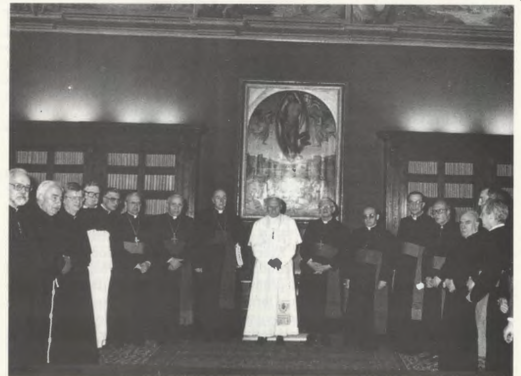
After the reading of the Decree of the heroic virtues of the Venerable Josemaria Escriva.