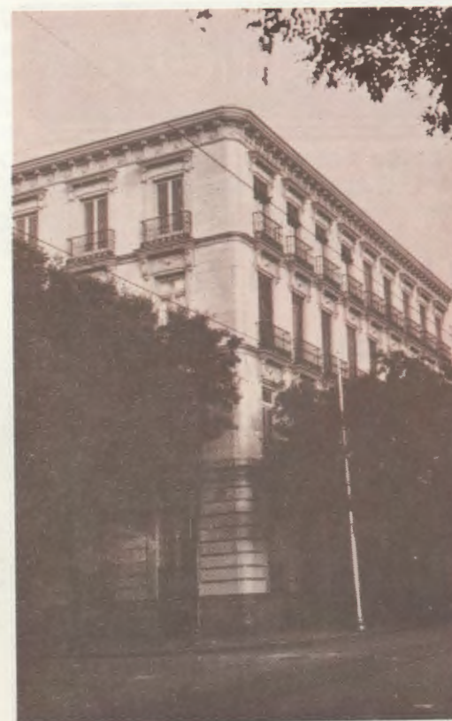
As of October, 1934 the DYA Student Residence occupied two apartments on the third floor of this building at 50 Ferraz Street (Madrid) while a fourth floor apartment housed the Academy.

The Servant of God drew interior strength from his conversation with Jesus in the tabernacle. He would spend long hours of the day and night in the chapel of the Academy-Residence. He had to overcome many obstacles to be able to set up that chapel, and had finally said the first Mass there on March 31, 1935. This was Opus Dei's first tabernacle, for which the founder had been longing since October 2, 1928, as we see from a letter in which he communicated to the Vicar-General the long-awaited event: "Finally, following