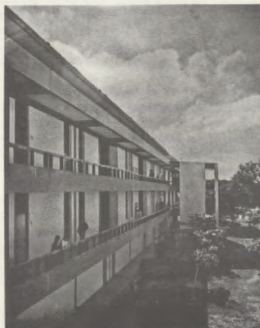
One of the university buildings.

In a sandy expanse fit only for growing carob beans there was born in 1968 the