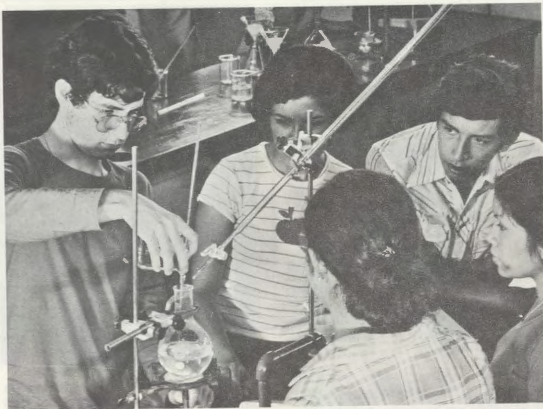
In the chemistry laboratory.

Only 13 percent of Piura's students can afford to pay full tuition. A similar proportion is granted partial scholarships. The rest, owing to their precarious finances, are awarded full scholarships. The university must, therefore, seek support from many contributors, supplemented by income from the engineering school whose services are contracted by local industry.