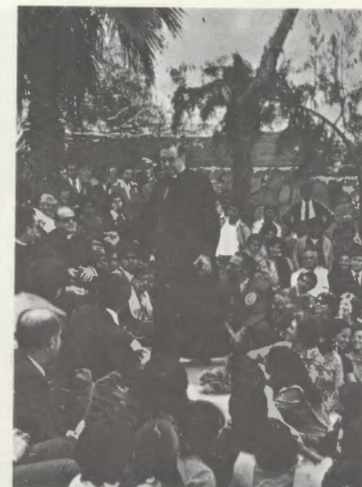
The Servant of God in the Larboleda Center in Lima, July 29, 1974. In the gathering are professors and students of the University of Piura.

The founder's words reflect the constant encouragement he poured into the university. Following his lead, the university has grown up to answer the region's needs, particularly for competent professionals. Currently its more than 1500 students are distributed among the schools of liberal arts, engineering (various branches), journalism and business administration. Besides the normal curriculum, the university has established a Service of Cultural Extension that offers programs for the area's professionals in varied fields: