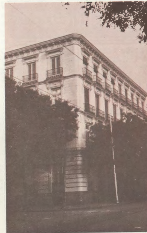
As of October, 1934 the DYA Student Residence occupied two apartments on the third floor of this building at 50 Ferraz Street (Madrid) while a fourth floor apartment housed the Academy.

The Servant of God drew interior strength from his conversation with Jesus in the tabernacle. He would spend long hours of the day and night in the chapel of the Academy-Residence. He had to overcome many obstacles to be able to set up that chapel, and had finally said the first Mass there on March 31, 1935. This was Opus Dei's first tabernacle, for which the founder had been longing since October 2, 1928, as we see from a letter in which he communicated to the Vicar-General the long-awaited event: "Finally, following