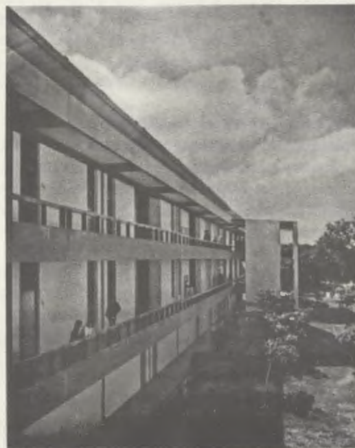
One of the university buildings.

In a sandy expanse fit only for growing carob beans there was born in 1968 the