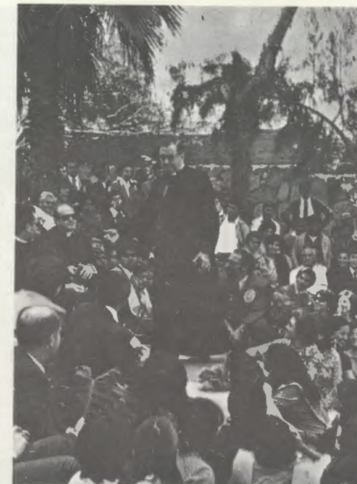
The Servant of God in the Larboleda Center in Lima, July 29, 1974. In the gathering are professors and students of the University of Piura.

The founder's words reflect the constant encouragement he poured into the university. Following his lead, the university has grown up to answer the region's needs, particularly for competent professionals. Currently its more than 1500 students are distributed among the schools of liberal arts, engineering (various branches), journalism and business administration. Besides the normal curriculum, the university has established a Service of Cultural Extension that offers programs for the area's professionals in varied fields: