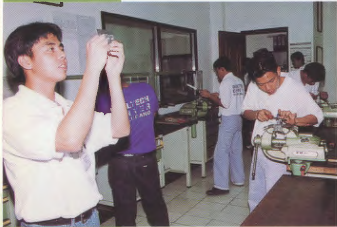
The sanctification of work is one of the central teachings of Blessed Josemaría. Opus Dei began its apostolic work in the Philippines in 1964.