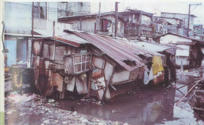
The poorest areas around Manila from which many of Dualtech’s students come.

How many students have you trained so far?