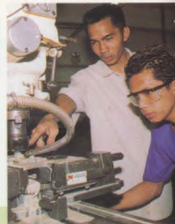
Dualtech offers courses in electromechanics and in precision engineering.

We have two courses in our dual training program. The first is in Electromechanics, a two-year course. A graduate in this course can repair, operate, and maintain air-conditioners, computers, motor vehicles, telecommunication systems, and the like. They can design and fabricate things like electric motors, pumps, and drive