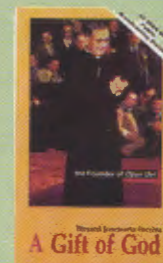
A Gift of God Video on Blessed Josemaria's life, including get-togethers with him.