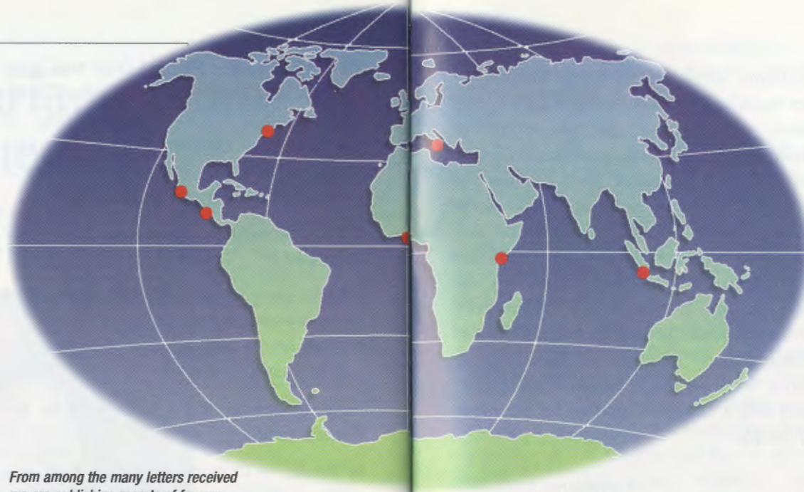
From among the many letters received we are publishing reports of favours from Asia, Africa, Europe and the Americas.

At the end of May my mother completed the first cycle of chemotherapy without major problems, obtaining the complete remission of her illness. Thus she was admitted to the second chemotherapy cycle, which lasted for two years, during which she came close to dying, as a consequence of side-effects and the weakening of the immune system produced by cytostatic drugs. I would like to add that, without our knowledge, she interrupted the chemotherapy before it was completed. She subsequently revealed this to us, convinced as she was that our Lady and Blessed Josemaria had granted her complete healing. And this is what actually happened. My mother is cured according to the standards of the World Health Organization; five years have passed since the final remission.