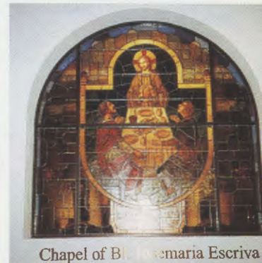
Chapel of Blessed Josemaria Escriva

Washington: the chapel of the Catholic Information Center has been dedicated to Blessed Josemaria.