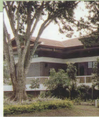
Dualtech was founded in 1982. Since then they have graduated twenty thousand skilled workers.

All of them! We charge a minimal tuition fee, which is necessary for them to appreciate the value of the course. But most are unable to pay even that small amount, especially now that we are in an economic crisis. The father of the family may