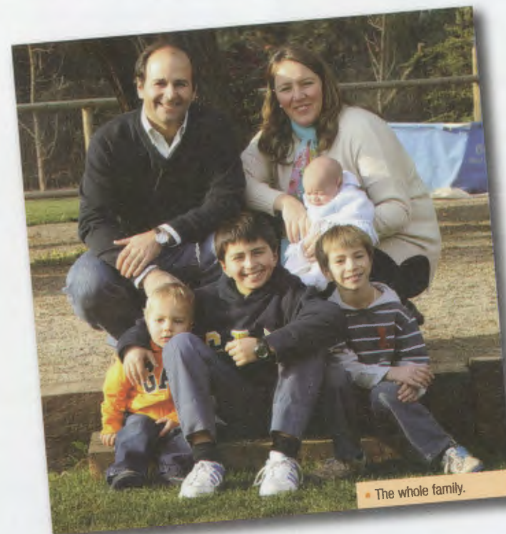
• The whole family.