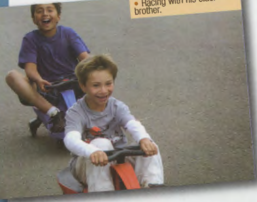
• Facing with his sister brother.

Interview with the mother of the cured child