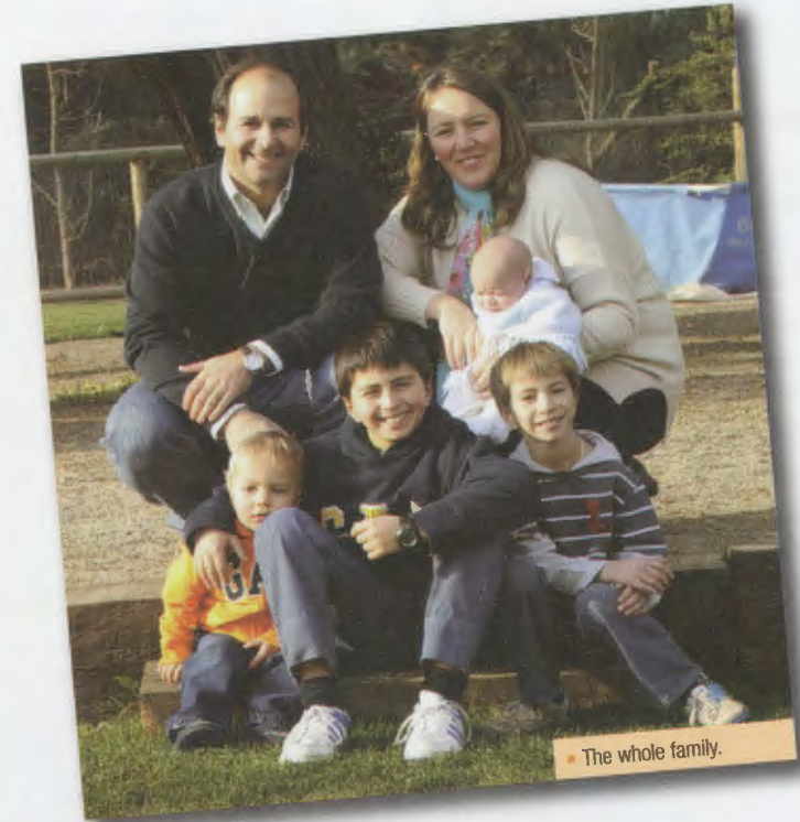
• The whole family.