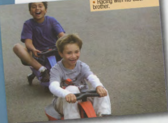
• Facing with his class brother.

days after his birth, and for the first forty eight hours after the operation everything went well. The doctors seemed happy with his condition.