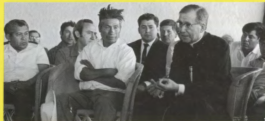
1 Blessed Paul VI & Saint Josemaría in Centro Ellis, a technical school in the suburbs of Rome (1965)