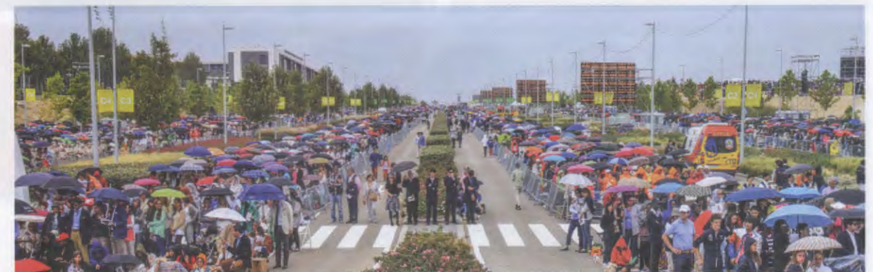
28 September, a sea of umbrellas.