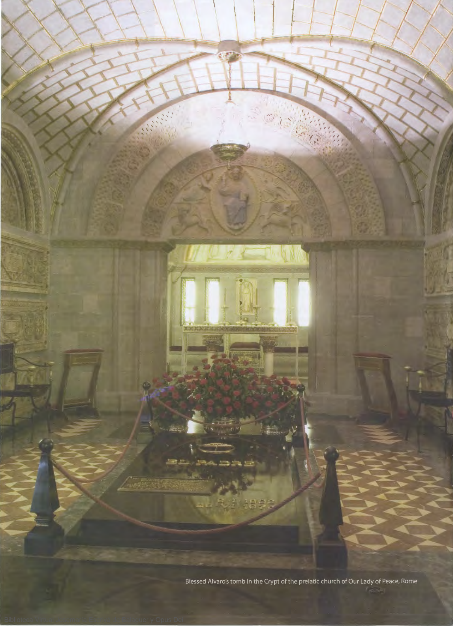
Blessed Alvaro's tomb in the Crypt of the prelate church of Our Lady of Peace, Rome