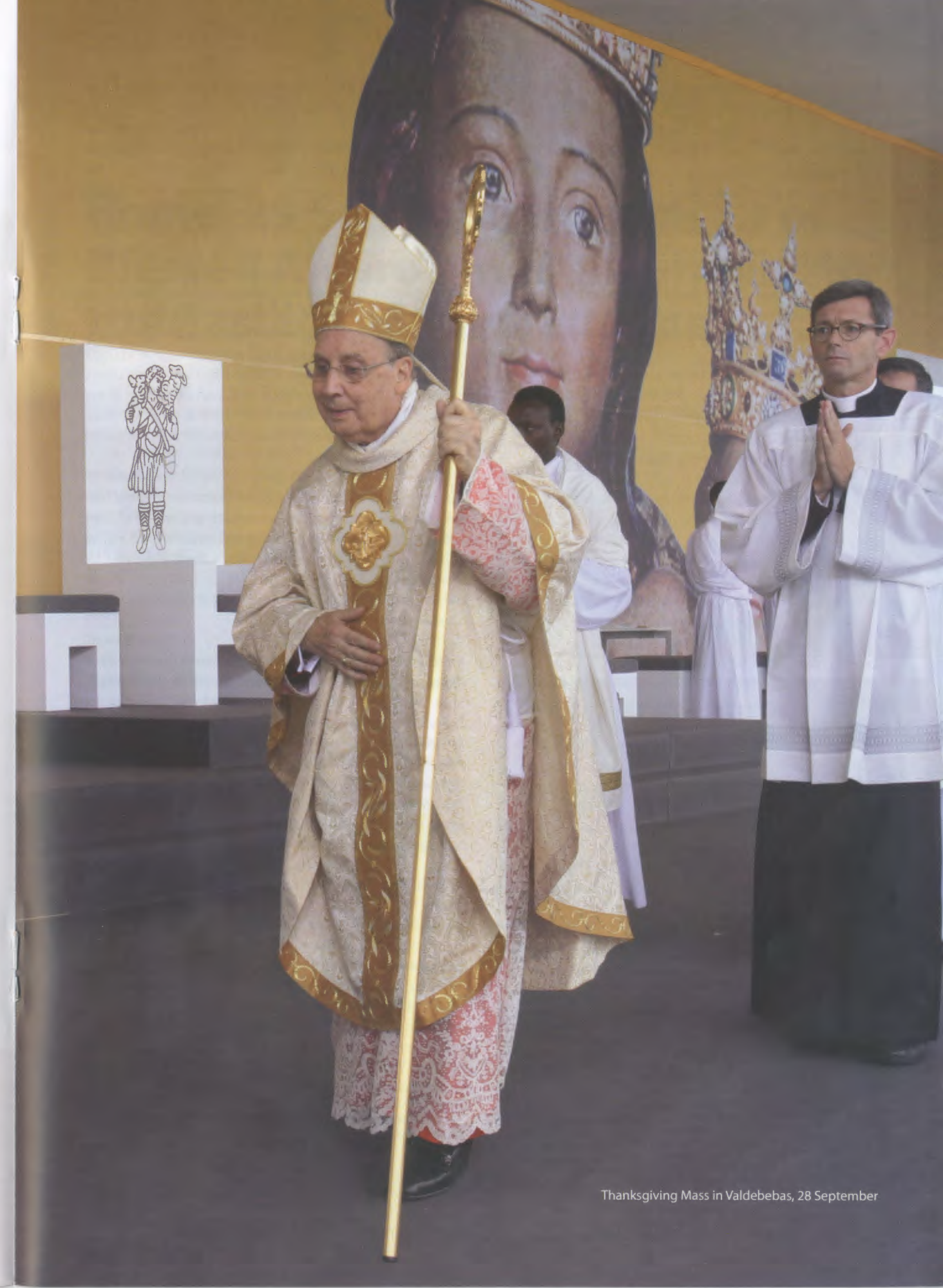
Thanksgiving Mass in Valdebebas, 28 September