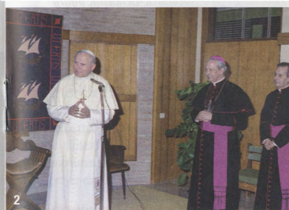
1 First and last pages of the decree on the miracle. 2 During the visit of Pope St John Paul II to the Elis Centre Rome, 15 January 1984.