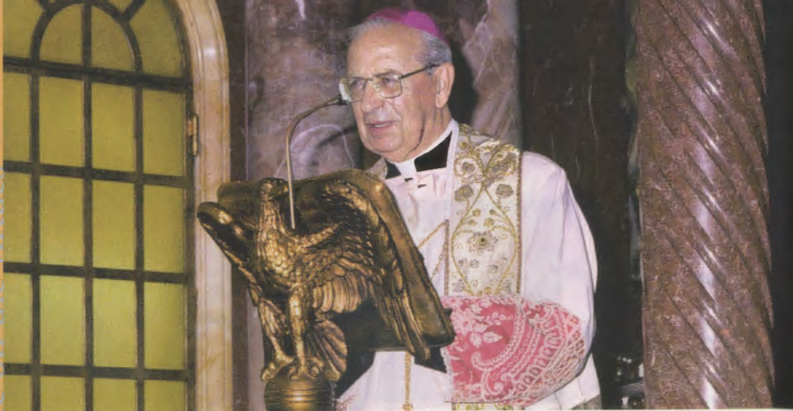
• During a homily on 26 June 1991.

28 November 1982 when Blessed John Paul II erected Opus Dei as a Personal Prelature and nominated Álvaro del Portillo its Prelate. On 6 January 1991 the Servant of God received episcopal ordination from the Roman Pontiff. Early in the morning of 23 March 1994, a few hours after his return from a pilgrimage to the Holy Places of our Divine Saviour, God called his Servant to himself. On that same day Blessed John Paul II visited his mortal remains, and after praying in silence, recited aloud the antiphon Salve Regina .