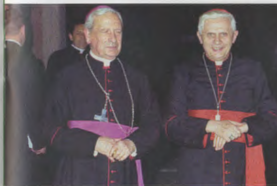
• With Cardinal Joseph Ratzinger (1987).

The Servant of God's love for the Church was manifest in his total communion with the Roman Pontiff and with the Bishops: he was always a most faithful son of the Successor of Peter, adhering without quibble to him and to his teaching. In describing the figure of this Pastor, moreover, mention must also be made of other characteristic features, such as his keenly-felt solicitude for the faithful of Opus Dei; his humility, prudence, fortitude, joy, and simplicity; his self-denial and his ardent desire to win souls for Christ, which he expressed also in his episcopal motto: Regnare Christum volumus! (We wish Christ to reign!) The Servant of God's reputation for holiness, already widespread in his lifetime, attained universal reach after his death. Between 2004 and 2008 two equally principal canonical processes regarding the life, virtues and reputation for holiness of the Servant of God were held at the Tribunal of the Vicariate of Rome and at the Tribunal of the Prelature, as well as eight rogatory processes in dioceses in Europe, North and South America and Australia.