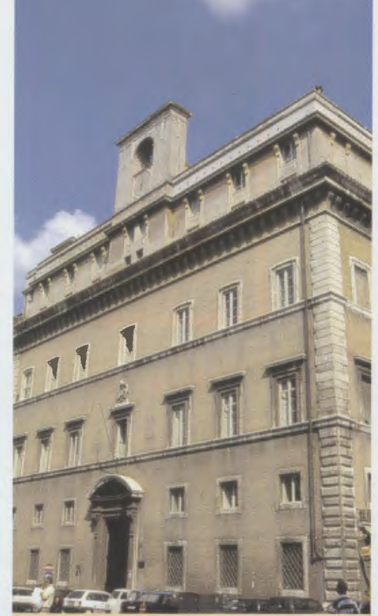
• The Apollinare Palace seat of the Holy Cross Pontifical University.

"Without their help, great or small, which is always the fruit of love for God and veneration for the priesthood, we would not be able to carry out the good that is being done in the service of the Church," Bishop Javier Echevarría, Prelate of Opus Dei, said recently in regard to those who assist the university financially.