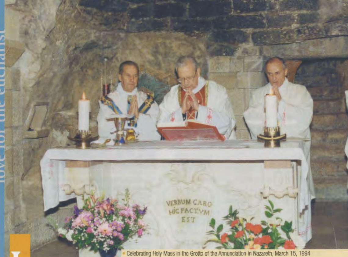
• Celebrating Holy Mass in the Grotto of the Annunciation in Nazareth, March 15, 1994