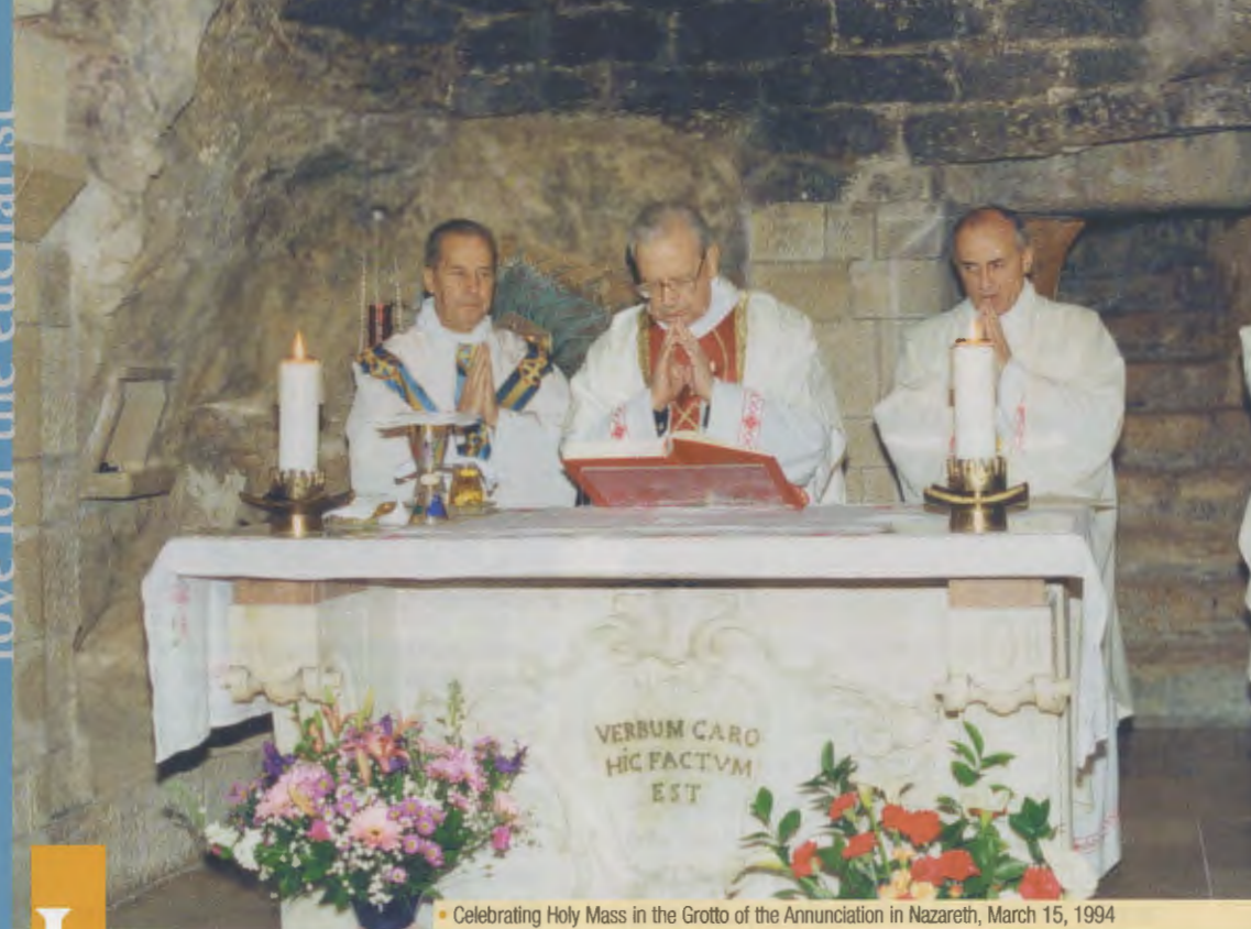
• Celebrating Holy Mass in the Grotto of the Annunciation in Nazareth, March 15, 1994