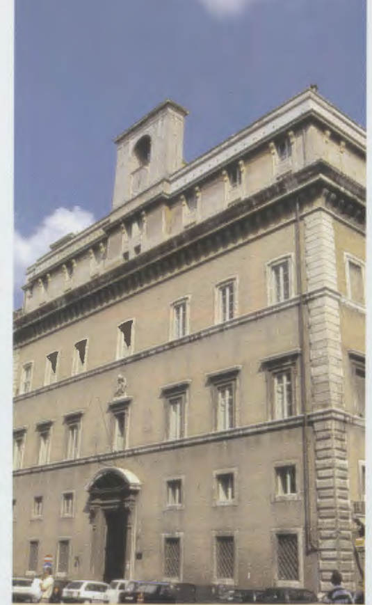
• The Apollinare Palace seat of the Holy Cross Pontifical University.

"Without their help, great or small, which is always the fruit of love for God and veneration for the priesthood, we would not be able to carry out the good that is being done in the service of the Church," Bishop Javier Echevarría, Prelate of Opus Dei, said recently in regard to those who assist the university financially.