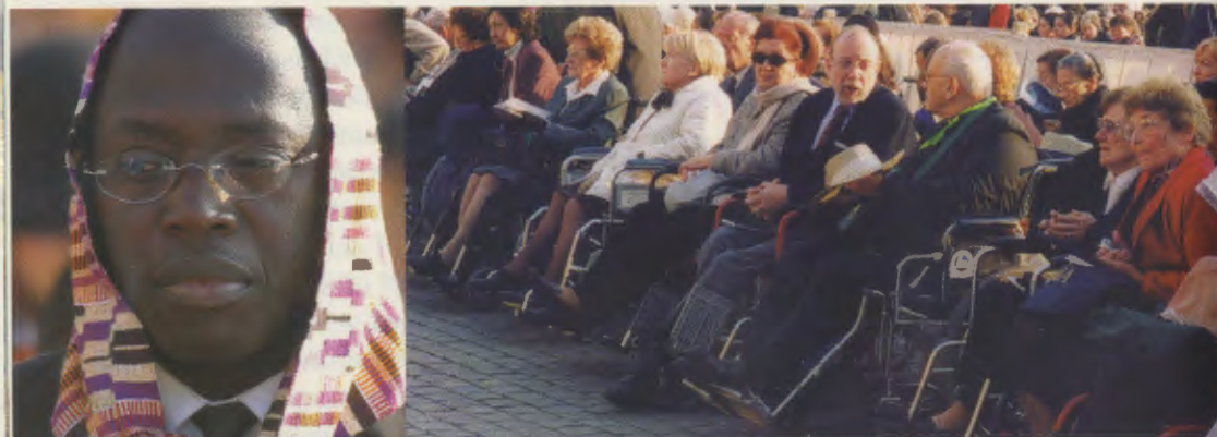
Men and women, sick and healthy, young and old ... a universal message