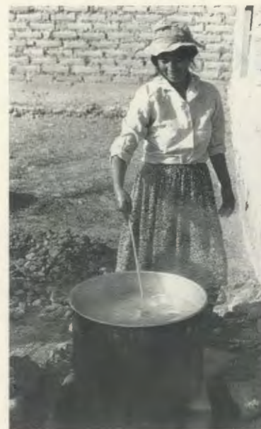
Twice a week, some 1700 children in 22 villages are cared for. Here we see a meal being prepared

Blessed Josemaría knew all about the hard lives these people lived, and he spoke to them in words that stimulated