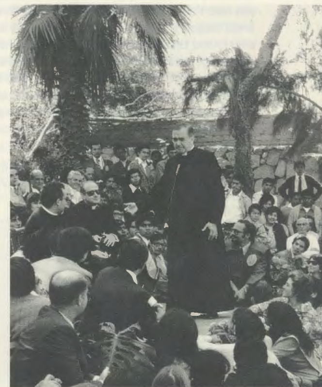
Blessed Josemaría in a family gathering in Peru, 29 July 1974

A week later, again in his notes, the intensity of Blessed Josemaría's prayer shows through, in passages expressing the path of love along which he was being guided by the Holy