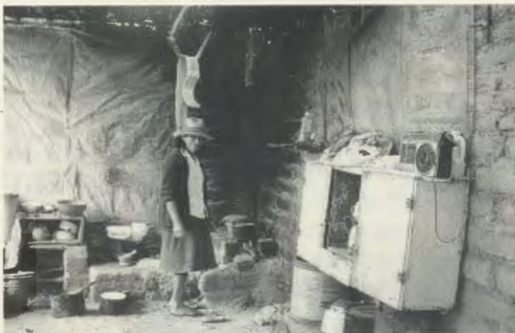
Inside a family dwelling in the Cañete Valley

improve their skills and have been capacitated to find solutions to the problems of their own families and communities. Among other initiatives, they have created eighty-six pilot farms, which form the main source of food for hundreds of families. A family gardening project has encouraged the growing of vegetables which enrich the local diet. Other activities they have started include shoe making, literacy, hygiene and sanitation courses.