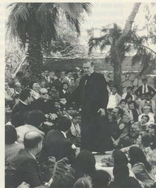
Blessed Josemaría in a family gathering in Peru, 29 July 1974

A week later, again in his notes, the intensity of Blessed Josemaría's prayer shows through, in passages expressing the path of love along which he was being guided by the Holy