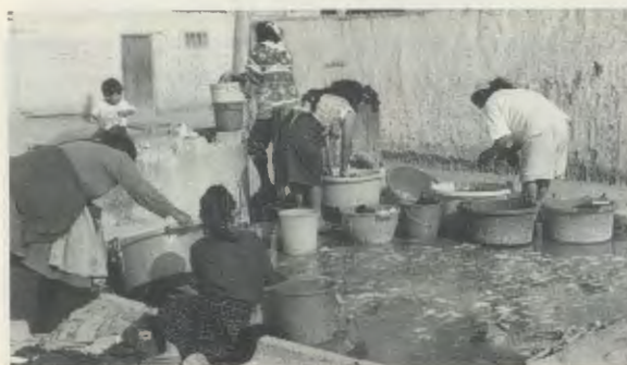
One of the programmes carried out from Condoray is to improve the dwellings of the country women, over 70% of dwellings have no toilet, running water or drains

In July 1974, the Founder of Opus Dei travelled to Peru and carried out an intensive catechesis. The Cañete Valley gave him a warm welcome. One of the meetings, which was held on 13 July, attracted a great number of country women from villages far and near. A veritable mosaic of races gathered there: angular faces burnt by the Andes sun, white people and people of mixed race, dark skinned people with beads in their hair, and others with Asian features. Blessed Josemaría's first words were: "I come to congratulate you on the great work of human progress that you carry out here. I have said human progress, and so, it is not only professional and material formation, it is also spiritual development." 1