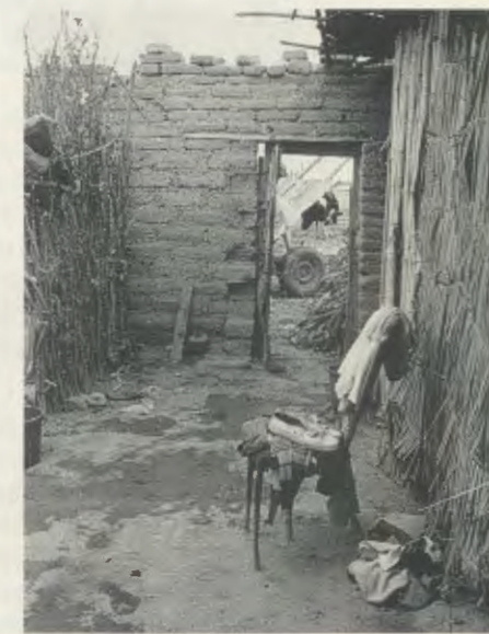
In the rural areas of the Cañete Valley, some two thirds of the dwellings are made of matting or adobe and have no running water

The work of social and Christian advancement carried out by Condoray has reached out beyond the frontiers of Peru. Since 1985, women university students from Canada, Great Britain, Germany, Ireland, France, Belgium and Spain have gone to work in the villages of Cañete. This international help runs alongside social programmes that take place throughout the year. The students who join in these cooperative undertakings give the country women classes in nutrition, first aid, sewing and cookery. And they do not return home empty-handed. They have discovered the greatness of the Christian joy of these people and their optimism in the face of adversity. They have seen that the people of this valley live lives truly filled with virtue, and that riches are far more than simply material well-being. They have seen Christianity lived in a consistent way.