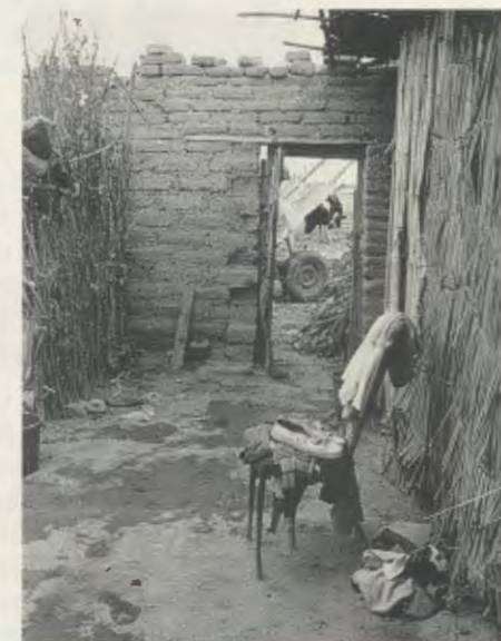
In the rural areas of the Cañete Valley, some two thirds of the dwellings are made of matting or adobe and have no running water

The work of social and Christian advancement carried out by Condoray has reached out beyond the frontiers of Peru. Since 1985, women university students from Canada, Great Britain, Germany, Ireland, France, Belgium and Spain have gone to work in the villages of Cañete. This international help runs alongside social programmes that take place throughout the year. The students who join in these cooperative undertakings give the country women classes in nutrition, first aid, sewing and cookery. And they do not return home empty-handed. They have discovered the greatness of the Christian joy of these people and their optimism in the face of adversity. They have seen that the people of this valley live lives truly filled with virtue, and that riches are far more than simply material well-being. They have seen Christianity lived in a consistent way.