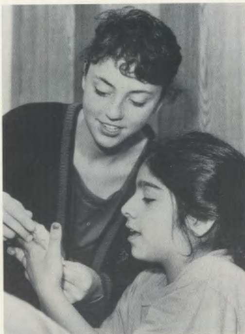
Hundreds of volunteers come each week to receive formation and to help the students.

The volunteers go to the centre weekly, to give tutorials and to organise cultural visits, social activities, sports, etc. In Metro a variety of classes, seminars, spiritual retreats, and the like, provide them with the possibility of adding to their own formation and of learning how to respond more effectively to the specific needs of the students.