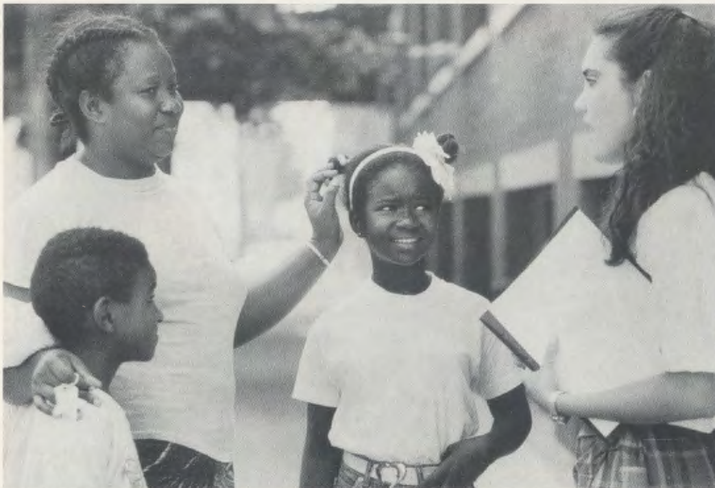
In Metro parents are helped to take an active part in their daughters' education.

In Conversations Blessed Josemaría wrote: Women are called to bring to the family, to society and to the Church, characteristics which are their own and which they alone can give: their gentle warmth and untiring generosity, their love for detail, their quick-wittedness and intuition, their simple and deep piety, their constancy... A woman's femininity is genuine only if she is aware of the beauty of this contribution for which there is no substitute - and if she