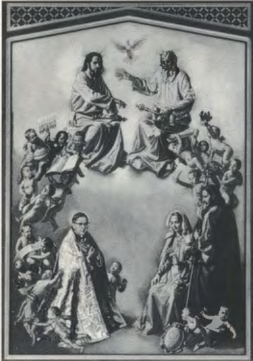
Detail of the reredos. Blessed Josemaría in Heaven.

From that time the work of the parish has been steadily increasing, with the administration of sacraments, catechesis for young people of different ages, doctrine classes for adults, blessings of houses, help for the needy, care of the sick, and so on. The foundation stone of the new building was laid on 15 May 1994. The ceremony, a Mass celebrated by Cardinal Ruini on the site of the future church, was attended by more than 1000 people, including the Prelate of Opus Dei, Mgr. Javier Echevarría.