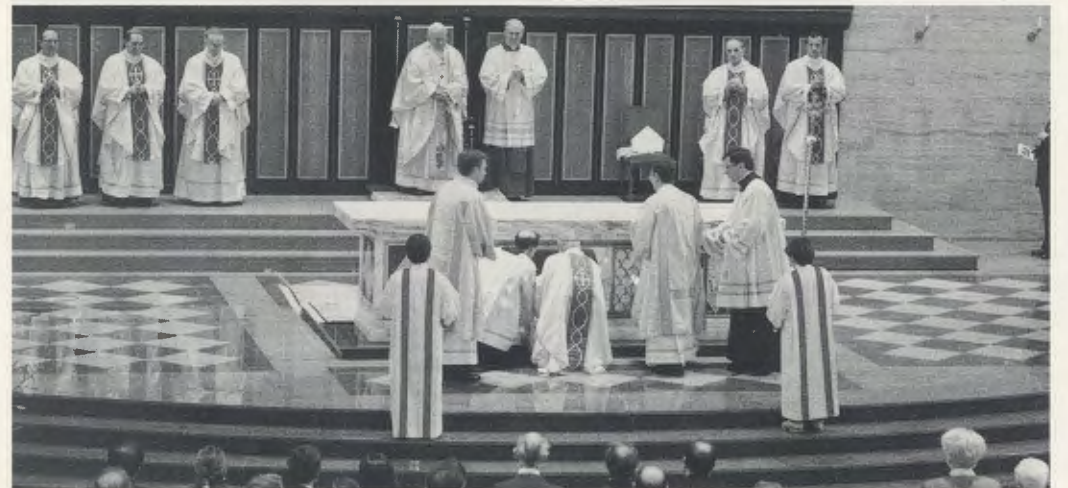
The Prelate of Opus Dei, following an ancient tradition, places relics of Blessed Josemaría within the altar.

The solemn recognition of his Christian example, proclaimed by the Vicar of Christ, and with him by the whole Church, is a compelling call to meditate once again on the deepest and ultimate meaning of the virtue of humility, which is a sure path to reach God. The sole ambition Blessed Josemaría had is summarised in his own words: my role is to hide away and stay in the background: may only