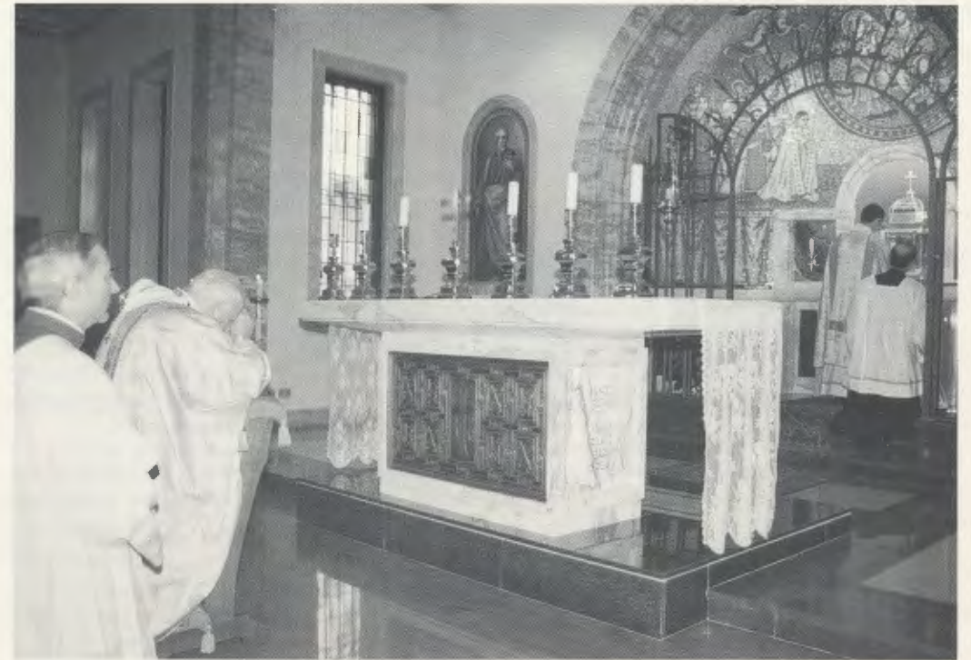
The Holy Father prays before the Blessed Sacrament as it is reserved for the first time in the Blessed Sacrament Chapel.

out with the greatest possible human perfection, for love of God, and for the service of men and women of every class and social position. As Your Holiness recalled on 17 May 1992 in the homily during the solemn rite of Beatification of the Founder of Opus Dei, work too is a means of personal holiness and apostolate when it is lived in union with Jesus Christ, for the Son of God, in the incarnation, has united himself in a certain way with the whole reality of man and with the whole of creation.