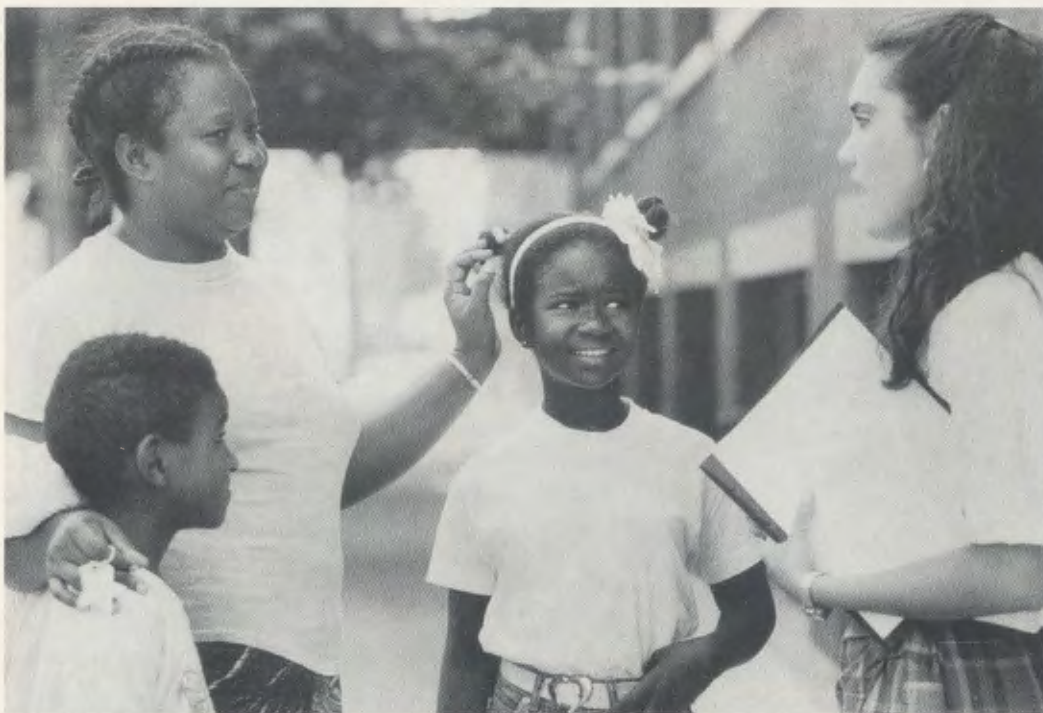
In Metro parents are helped to take an active part in their daughters' education.

In Conversations Blessed Josemaría wrote: Women are called to bring to the family, to society and to the Church, characteristics which are their own and which they alone can give: their gentle warmth and untiring generosity, their love for detail, their quick-wittedness and intuition, their simple and deep piety, their constancy... A woman's femininity is genuine only if she is aware of the beauty of this contribution for which there is no substitute - and if she