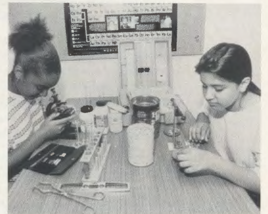
High School students in a practical class.