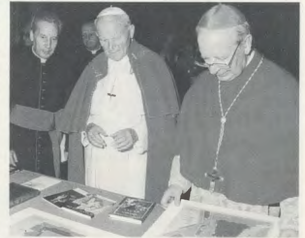
On 17 May 1992, after the Beatification of the Founder of Opus Dei, Mgr. Alvaro del Portillo presented to the Holy Father the project for the future church of Blessed Josemaría.