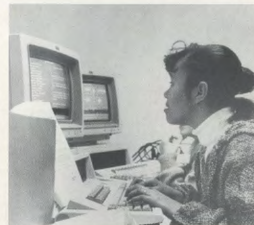
Whilst preparing for University, the girls acquire and grow in human and Christian virtues.

Lastly, Metro encourages the co-operation of hundreds of voluntary helpers. These are professional women and university students, to whom it offers the opportunity to place their time and their knowledge at the disposal of people and families in need.