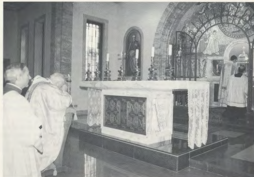
The Holy Father prays before the Blessed Sacrament as it is reserved for the first time in the Blessed Sacrament Chapel.

out with the greatest possible human perfection, for love of God, and for the service of men and women of every class and social position. As Your Holiness recalled on 17 May 1992 in the homily during the solemn rite of Beatification of the Founder of Opus Dei, work too is a means of personal holiness and apostolate when it is lived in union with Jesus Christ, for the Son of God, in the incarnation, has united himself in a certain way with the whole reality of man and with the whole of creation.