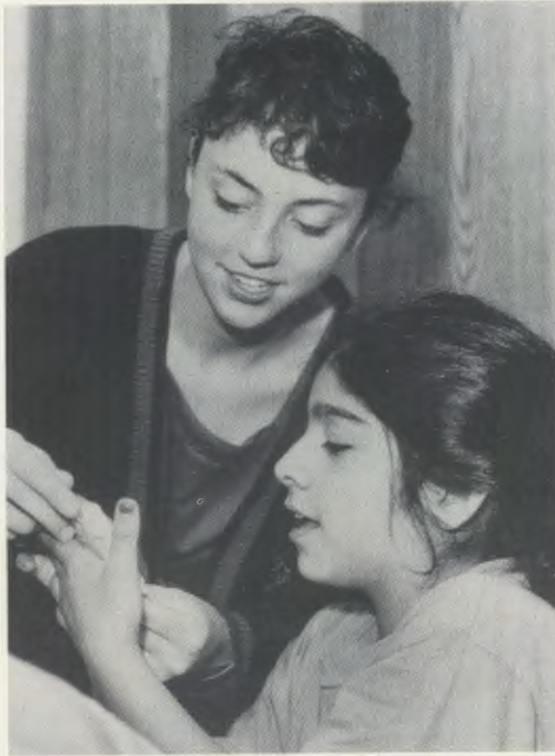
Hundreds of volunteers come each week to receive formation and to help the students.

The volunteers go to the centre weekly, to give tutorials and to organise cultural visits, social activities, sports, etc. In Metro a variety of classes, seminars, spiritual retreats, and the like, provide them with the possibility of adding to their own formation and of learning how to respond more effectively to the specific needs of the students.