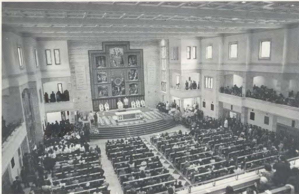
View of the interior of the church during the Mass of dedication.

We have tried to make this church reflect the message God entrusted to Blessed Josemaría: the pursuit of holiness through ordinary work, carried