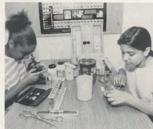
High School students in a practical class.