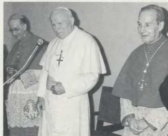
The Holy Father during his visit to the new parish complex.