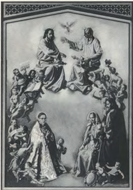
Detail of the reredos. Blessed Josemaría in Heaven.

From that time the work of the parish has been steadily increasing, with the administration of sacraments, catechesis for young people of different ages, doctrine classes for adults, blessings of houses, help for the needy, care of the sick, and so on. The foundation stone of the new building was laid on 15 May 1994. The ceremony, a Mass celebrated by Cardinal Ruini on the site of the future church, was attended by more than 1000 people, including the Prelate of Opus Dei, Mgr. Javier Echevarría.