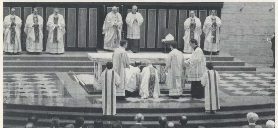
The Prelate of Opus Dei, following an ancient tradition, places relics of Blessed Josemaría within the altar.

The solemn recognition of his Christian example, proclaimed by the Vicar of Christ, and with him by the whole Church, is a compelling call to meditate once again on the deepest and ultimate meaning of the virtue of humility, which is a sure path to reach God. The sole ambition Blessed Josemaría had is summarised in his own words: my role is to hide away and stay in the background: may only