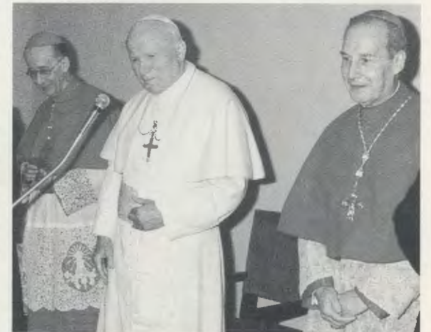
The Holy Father during his visit to the new parish complex.