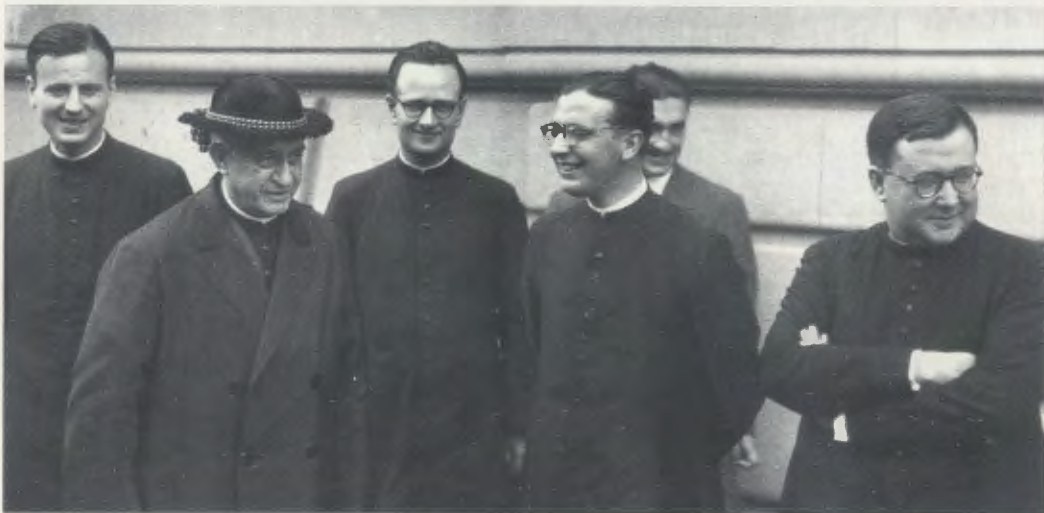
The Founder of Opus Dei accompanied by the Bishop of Madrid and the first three of his sons to be ordained, on 25 June 1944.

The urgent need for priests led him to pray intensely over a long period, with great faith in God's power and providence. Years later he was able to write: For years I prayed with trust and expectation for your brothers who were to be ordained to the priesthood, and for those who would later follow in their footsteps. I prayed so