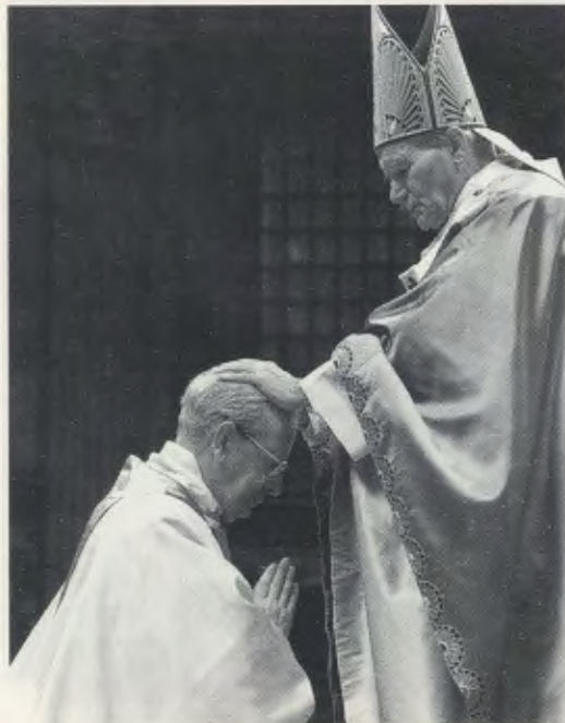
Rome, 6 January 1991. Mgr Alvaro del Portillo is ordained bishop