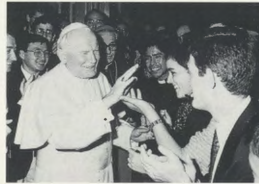
Pope John Paul II with some of those attending the closing ceremony of the theological Congress

3. The deep awareness with which the Church today is conscious of serving a redemption that concerns every aspect of human existence was prepared, under the guidance of the Holy Spirit, by a process of gradual intellectual and spiritual development. The message of Blessed Josemaría, to which you devoted the work of your convention, is one of the most signifi-