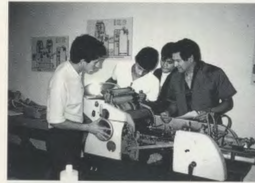
During a printing lesson.

The Founder of Opus Dei went to Guatemala in February 1975, and his visit played an important part in Kinal's history. The few days he spent in Guatemala, intense and full of apostolate as they were, bore abundant fruit which has only increased as time has gone by. At present, over five thousand people attend Kinal's various activities every year. Its