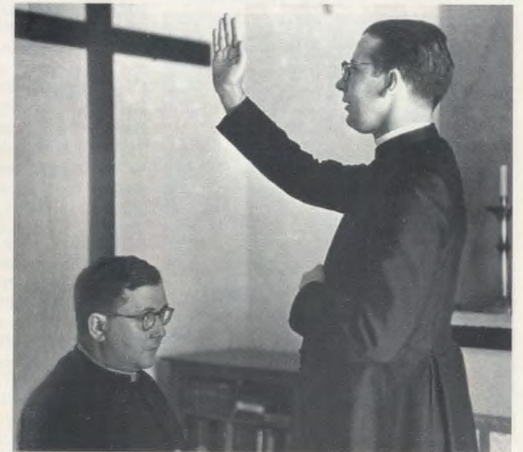
The newly ordained Fr Alvaro del Portillo gives his blessing to Blessed Josemaría Escrivá, on 26 June 1944.

The three candidates gradually completed their examinations and approached the end of their studies. The tonsure ceremony took place on 20 May; on subsequent dates