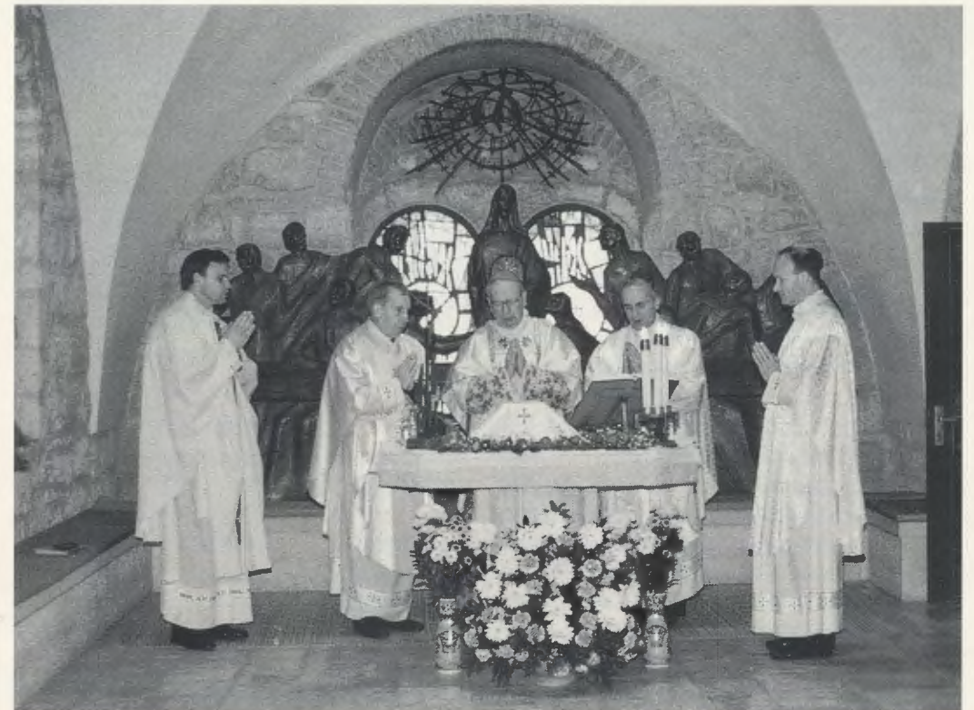
Jerusalem, 22 March 1994. Bishop del Portillo celebrated his last Mass in the church of the Cenacle.

priests of Opus Dei. Other ordinations, each more numerous than the last, were to follow, with the result that at the Founder's death there were almost a thousand priests—the sons of his prayer, his mortification and his vigilance as a good shepherd. Those priests, and those subsequently ordained during the years in which Bishop Alvaro del Portillo