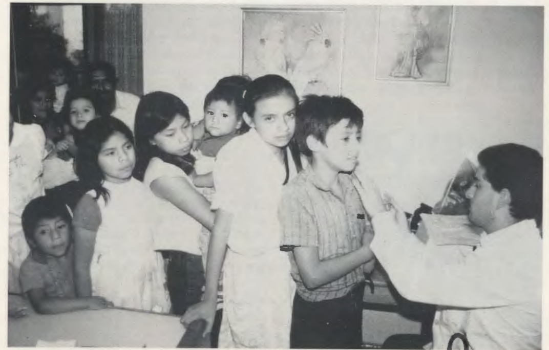
Vaccination programme in the Kinal out-patients' clinic.

Not for nothing was the sanctification of work one of the lessons he taught us during his stay in Guatemala. In one of his get-togethers with a large audience from all over Central America, someone asked him about St Joseph. Blessed Josemaría Escrivá answered, "I venerate him with all my soul, and I always call him my Father and my Lord; and I add, 'whom I love so much!' I do love him very much. He teaches us the value of ordinary work, which is the human means to holiness that we have within our reach: doing the ordinary things of every day, of every hour, of every minute, with love. Whether or not we feel like it, but with love and affection. Whether or not we feel like it, but as well as we possibly can. Whether or not we feel like it, but in a way that can be offered to God our Lord. It doesn't matter whether we are building a skyscraper or making a wicker basket. I