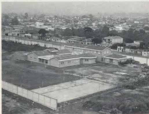
Kinal, "the place where fire is born".

Kinal is a Mayan word meaning "the place where fire is born". That is what happened: that first spark of generosity on the part of some university students, inspired by the Founder of Opus Dei's zeal for ser-