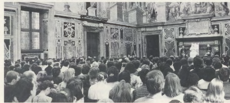
Rome, 14 October 1993. The Holy Father, Pope John Paul II, spoke to those taking part in the Theological Study Convention on the Teaching of Blessed Josemaría Escrivá

On 14 October the 500 participants in the Convention were received in audience by His Holiness John Paul II. The Holy Father addressed them as follows.