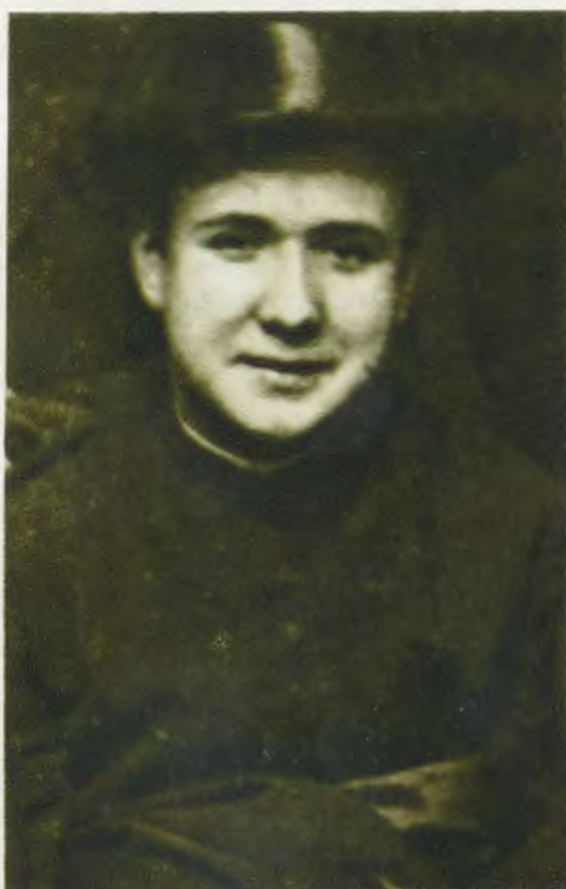
Monsignor Josemaría Escrivá de Balaguer as a seminarian in Saragossa, 1923.

Years later he recalled those memories. There come to mind so many manifestations of God's Love during my adolescent years, when I sensed that Our Lord wanted something of me, something though I knew not what it was. Ordinary events and details, seemingly without significance, and yet He used them to place within my soul a divine restlessness. And so I well understand that love so human and yet so divine of Theresa of the Child Jesus, whose heart is moved when in