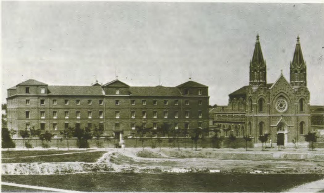
The house of the Vincentian Fathers and the Milagrosa basilica on the Calle García de Paredes, Madrid, as they were in 1928.

aspirations: Lord, what is it you want? What are you asking of me? I had a feeling that he wanted me to take on something new, and that Rabboni, ut videam! – Master, that I may see – moved me to beseech Christ again and again: Lord, whatever it is that you wish, let it be done.