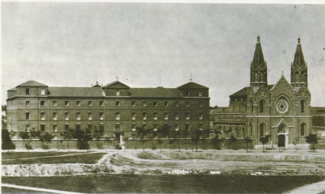
The house of the Vincentian Fathers and the Milagrosa basilica on the Calle García de Paredes, Madrid, as they were in 1928.

aspirations: Lord, what is it you want? What are you asking of me? I had a feeling that he wanted me to take on something new, and that Rabboni, ut videam! – Master, that I may see – moved me to beseech Christ again and again: Lord, whatever it is that you wish, let it be done.