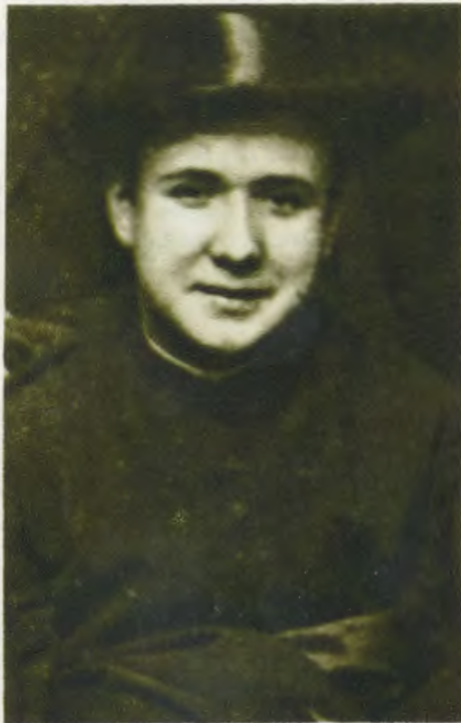
Monsignor Josemaría Escrivá de Balaguer as a seminarian in Saragossa, 1923.

Years later he recalled those memories. There come to mind so many manifestations of God's Love during my adolescent years, when I sensed that Our Lord wanted something of me, something though I knew not what it was. Ordinary events and details, seemingly without significance, and yet He used them to place within my soul a divine restlessness. And so I well understand that love so human and yet so divine of Theresa of the Child Jesus, whose heart is moved when in