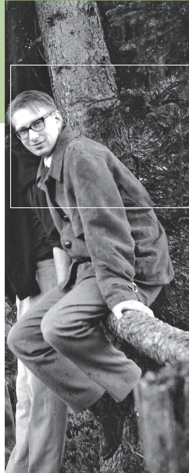
On a mountain trip in 1962.