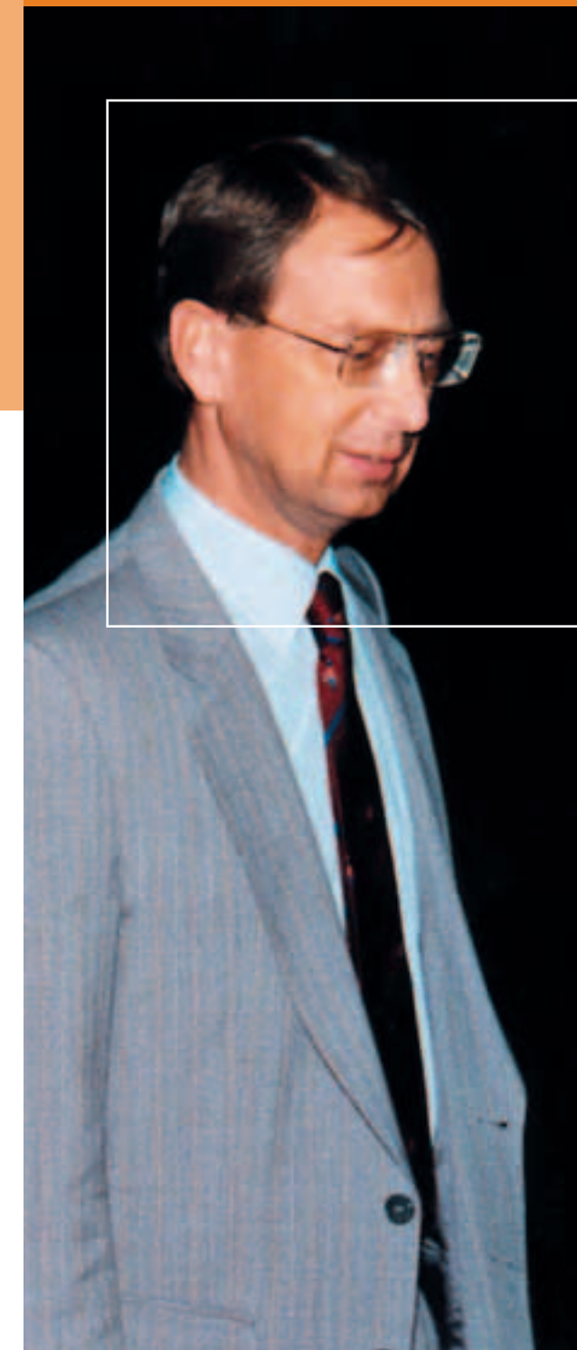
Three months before his death, with Msgr. Alvaro del Portillo, the Prelate of Opus Dei