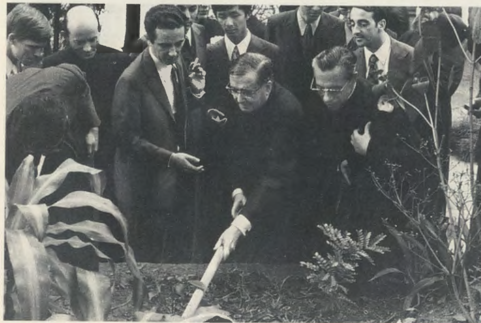
Sítio de Aroeira, Brazil, 1974.

"All who had the privilege of knowing him can testify that when he died in 1975, at the age of 73, he was so young! He had not grown old with the passage of time. On the contrary, his spirit had grown younger year by year, with an incredible vitality of youthfulness and cheerfulness: born in no easy fashion but over a lifetime of heroic struggle which brought him closer day by day to God" ( Opus Dei in Africa: a force for good , in the Sunday Nation , Nairobi, 3-2-1980).