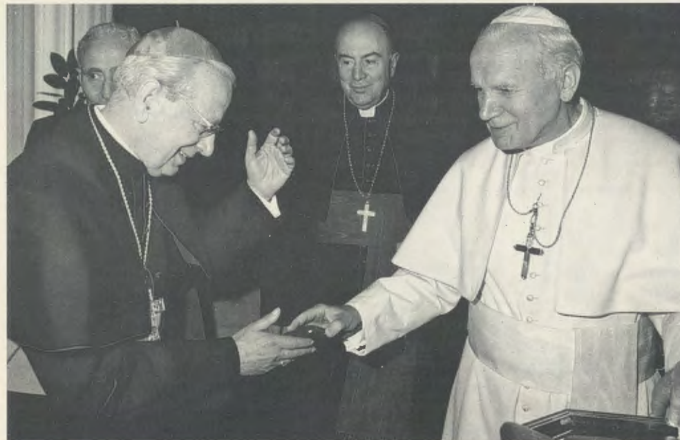
The Holy Father with Cardinal Felici, the Prefect of the Congregation of Saints, and Monsignor Alvaro del Portillo, the Prelate of Opus Dei, after the declaration of the heroic virtues of the Venerable Josemaria Escrivá on 9 April 1990.

In 1946 the Servant of God took up residence in Rome. In 1947 and 1950 he obtained approval for Opus Dei as an institution of pontifical right. With tireless charity and active hope he guided the development of Opus Dei throughout the world, promoting a vast mobilisation of lay people who became aware of their personal responsibility in the Church's mission. He inspired numerous initiatives in the work of evangelisation and social welfare. Everywhere he fostered vocations to the priesthood and to the religious life. He carried out exhausting journeys through Europe and America, proclaiming the Church's teaching with most vigorous faith. Above all he devoted himself tirelessly to the task of forming the members of Opus Dei — both priests and laity, men and women — so that they would acquire a solid spiritual life, an exemplary adherence to the Church's Magisterium and an ardent zeal for souls which would express itself in a personal commitment to carry out a far-reaching apostolate. ' Omnes cum Petro ad Iesum per Mariam! ' — All with Peter to Jesus through Mary! was the aspiration tirelessly preached and practised by the Servant of God from the beginning of his priesthood.