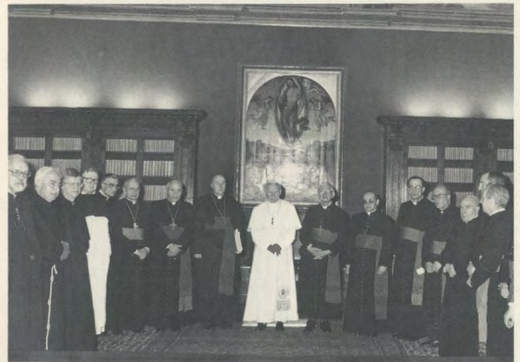
9 April 1990. After the reading of the Decree on the heroic virtues of the Venerable Josemaría Escrivá.

Josemaría Escrivá was born in Barbastro, Spain, on the 9th of January 1902, of devout and godfearing parents. At about the age of fifteen, he felt the first signs of a