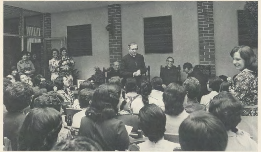
Guatemala, 1975: In a training centre for women.

His love for others was universal, beginning with the poorest and the most needy in body and soul" (GAP, HRF P-00052, Letter to the Holy Father, Leiria, 1-7-1975).