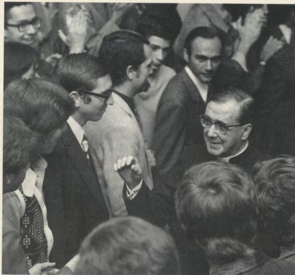
São Paulo, Brazil, 1974.

Since founding Opus Dei, he gave the Church supreme service, full of love and constancy" (GAP, HRF P-00644, Letter to the Holy Father, Osaka, 27-7-1975).