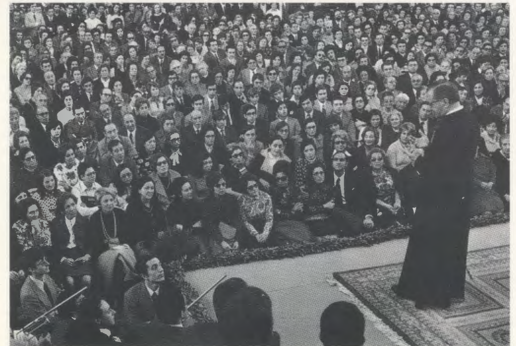
The founder of Opus Dei in a gathering at Brafa, Barcelona (Spain), on November 22, 1972.