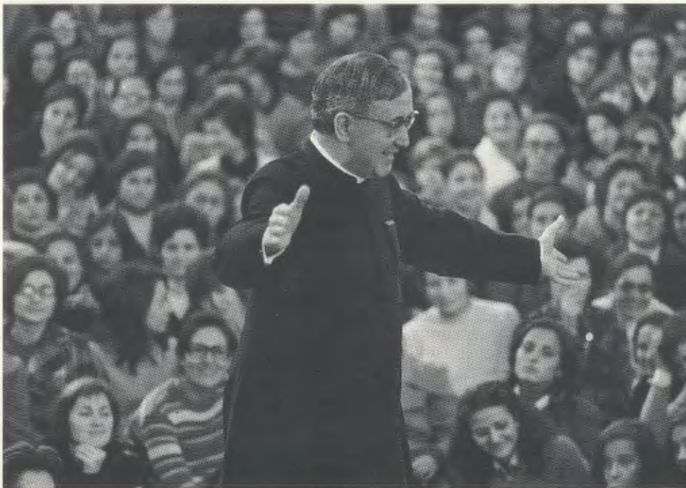
Monsignor Escriva in a get-together at Brafa, Barcelona (Spain), on November 25, 1972.

In spite of the alarming news coming from the convent near the middle of June 1976, the sisters of the religious did not grow discouraged, but rather intensified their petitions. And, in very close dependency upon their prayers, there came the unforeseen cure.