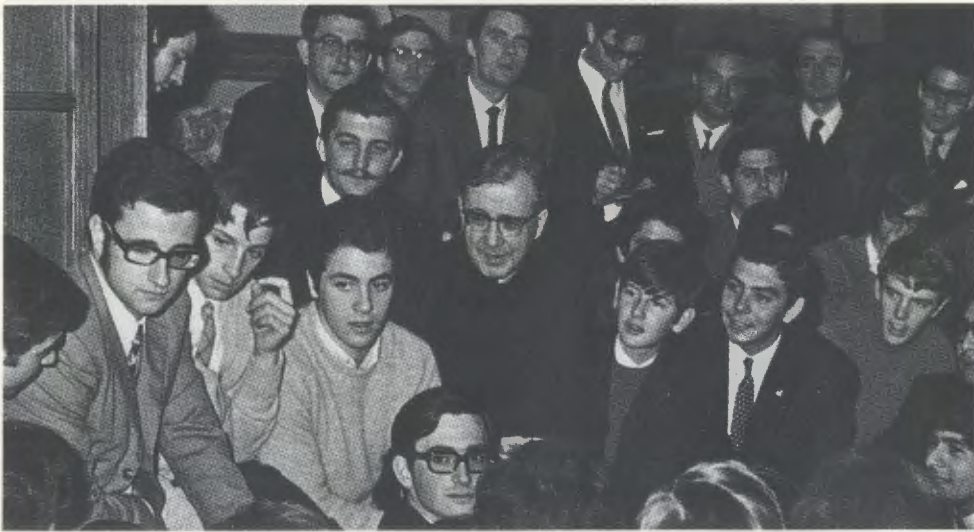
Monsignor Escriva (center) in an informal meeting with youths in Rome, March 26, 1970.

The medical experts who visited her in 1982 during the canonical process testified that the cure had been complete and that in all that time the illness had not reappeared: "The subjective condition of Sister Concepcion is excellent. Sister Concepcion Boullon Rubio is found to be absolutely cured."