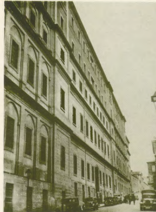
The façade of the General Hospital of Madrid as it was in the 1930s. In the background can be seen the church of the Patronato of Santa Isabel, where the Servant of God served as Rector.

One day Don Josemaría heard about the state things were in at the General Hospital of Madrid. It was an enormous building on the same street as the church of Santa Isabel. The Servant of God already had ample experience of caring for the sick and the lonely. He saw immediately that there was an opportunity here to give a helping hand, and he also thought that such service in the General Hospital would be an excellent way of forming the young men around him. His ideal was that all those who came in contact with him should go deeper into the fundamental truths of the faith. He was not content to let them be Christians just in theory. He wanted them to see the supernatural meaning of their practical everyday living, with all its sorrows and joys. Long years of experience had taught him that close contact with illness and pain is a great way to help people discover the real meaning of facts and events. Contact with suffering can help people to forget themselves, to open their eyes and see how great the Christian ideal is, and how it can stimulate them to give themselves generously to others.