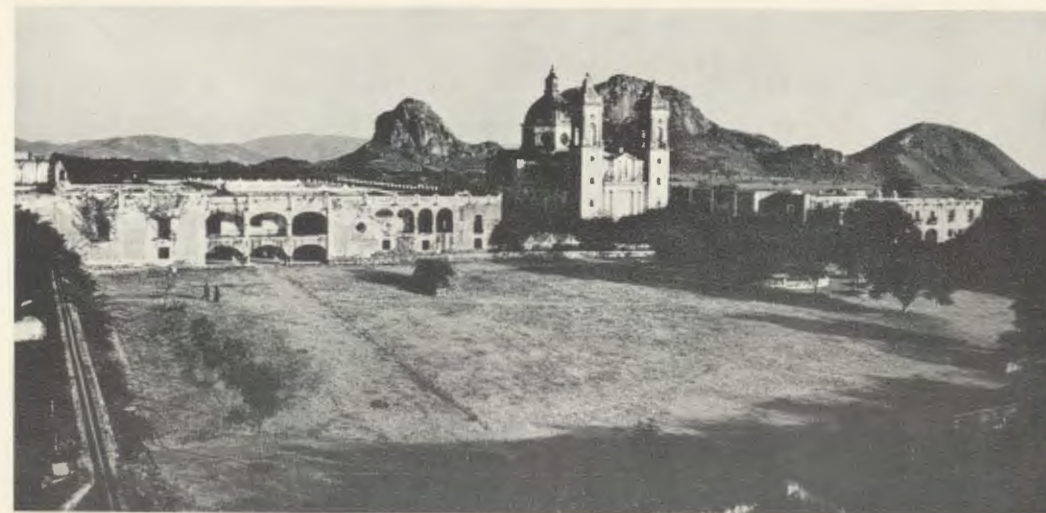
A view of Montefalco (Jonatepec, Morelos State, Mexico) in 1967.

turned off on to an unpaved road and crossed the Amilpas valley which is in the State of Morelos. I was accompanied by some members of Opus Dei who spoke enthusiastically during the journey about an offer made by the owners of the property, the Campo y Deporte Association, to Opus Dei to take charge of this apostolic initiative, and of Mgr. Escrivá de Balaguer's interest in accepting the offer.