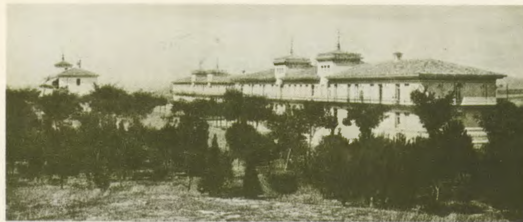
The King's Hospital, Madrid, shortly after it was opened in 1925.

Another hospital he went to was the King's Hospital, which during those years of the Second Spanish Republic had been renamed the National Hospital. It was arguably the most modern hospital in Madrid and it specialised in treating infectious diseases. Many of its patients had tuberculosis, for which at the time there was no known cure. A nun who belongs to the Daughters of Charity has the following recollections of Mgr. Escrivá de Balaguer, "I still remember very clearly how Don Josemaría spoke to us about God, taking his cue from anything that might have happened (. . .) and he would say the same things to the patients (. . .). I remember how young consumptive girls even recovered their natural good spirits, although they knew they were going to die (. . .). I can well understand