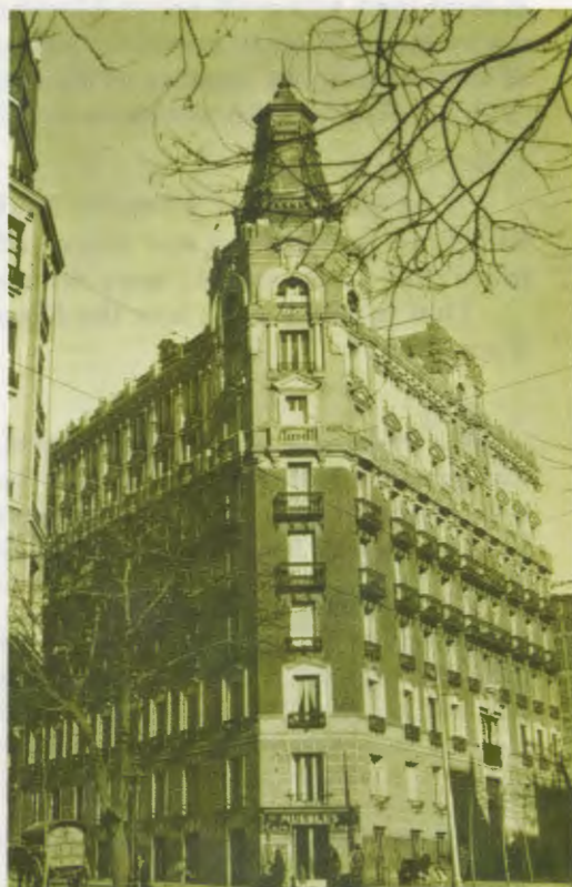
The DYA Academy had its premises on the first floor of this building in Luchana Street, Madrid, from the end of 1933 until the beginning of the academic year 1934-35.

One area of apostolic activity in which he had a particular interest in those years was work with university students. He realised that, precisely because it was God's will that he should reach all sectors of society, this objective could be attained sooner working with young university students. He used to talk to them walking in the streets of Madrid or invite them to meet in his mother's flat. When they were out of town, in holiday periods, he would keep in touch with them by letter. Here, for example, are a few lines from a letter to one of those young men: Trust entirely in Jesus. Speak to him, as he is, a loving Friend. Tell him about yourself, and about us. Parade us all before you: the 'oldies' and the new ones... and all those who are to come, to the end of time. Be convinced that he is listening to you, because it's true. Fill yourself with faith. With faith and Love. Turn to Our Lady and to Saint Joseph, our Father and Lord. Keep always on close terms with your Guardian Angel. All this is solid and sturdy devotion. If it should happen (or happen often) that you are dry and arid before the Tabernacle, and don't know what to say to Jesus... act as if you were on sentry duty guarding him: persevere as usual, to the last minute: faithful, like a little dog at the feet of its master. 1