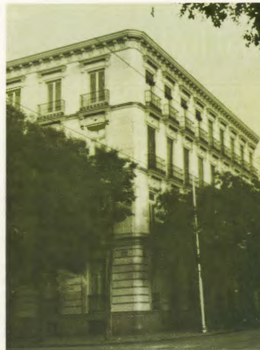
From October 1934 the DYA Residence occupied two flats on the second floor of this building at 50 Ferraz Street, Madrid. The Academy was in another flat on the top floor.