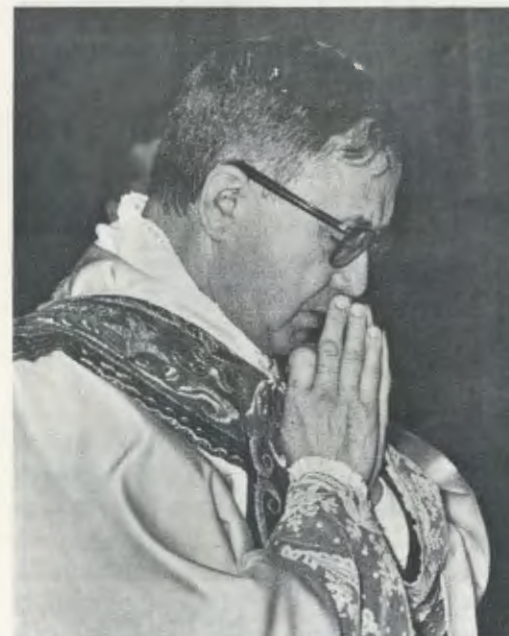
The Founder of Opus Dei during Holy Mass, on 21 March 1964, in Rome.

In uniting himself to Jesus Christ's self-surrender to the Father for the salvation of all mankind, the Christian learns to share in the longing to redeem, which filled the heart of the Son of God. Effective desires to serve his neighbour well up in his soul; to the sacrifice of Jesus he unites