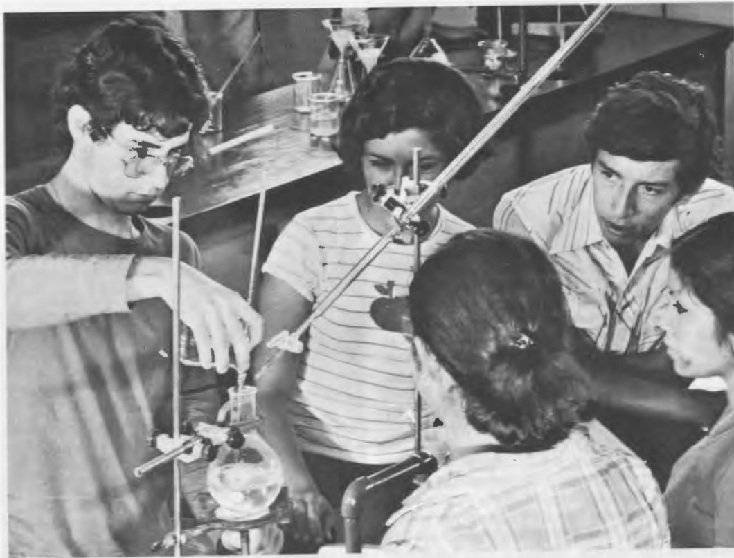
In the chemistry laboratory.

people; income is also received from work done for industry in the university's engineering workshops.