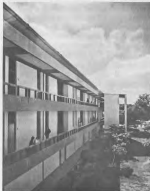
One of the University buildings.

Piura University began in 1968, on a sand-covered site dotted here and there