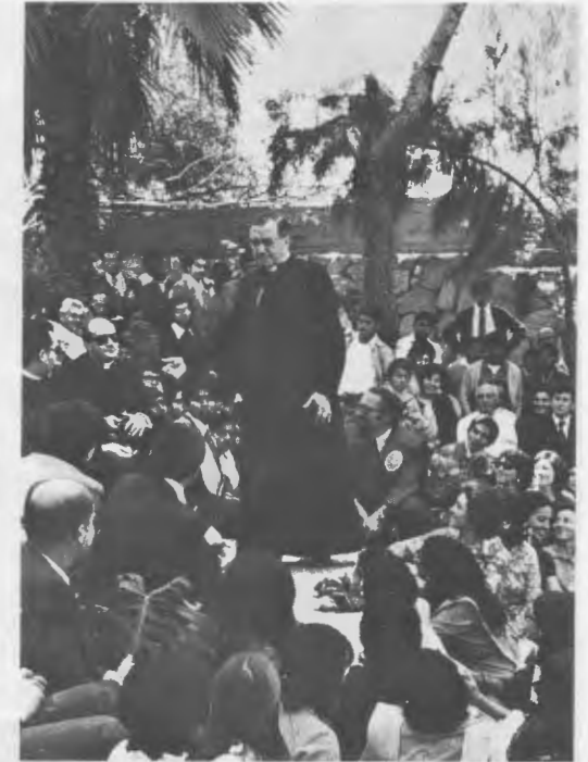
The Servant of God on 29 July 1974 in Larboleda, a conference centre near Lima. Lecturers and students from Piura University took part in the get-together.

These words are indicative of the constant encouragement which the Founder gave to Piura University. Following his guidance an educational plan was drawn up which seeks to meet the requirements of the region and, especially, the demand for properly trained professional men and women. At present Piura University has over fifteen hundred students attending the following faculties: Liberal Arts, Engineering Science, Industrial Engineering, Journalism and Business Administration. As well as providing the normal degree courses, the University has set up a Department of Extramural Studies which runs programmes for local people in subjects such as Industry, Commerce, Secondary Education and Economics. Aided by its favourable geographical situation, Piura University also runs international