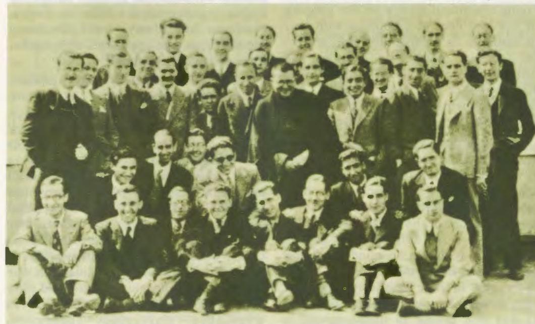
The Servant of God with some students from DYA.