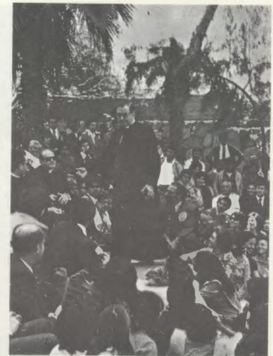
The Servant of God in the Larboleda Center in Lima, July 29, 1974. In the gathering are professors and students of the University of Piura.

The founder's words reflect the constant encouragement he poured into the university. Following his lead, the university has grown up to answer the region's needs, particularly for competent professionals. Currently its more than 1500 students are distributed among the schools of liberal arts, engineering (various branches), journalism and business administration. Besides the normal curriculum, the university has established a Service of Cultural Extension that offers programs for the area's professionals in varied fields: