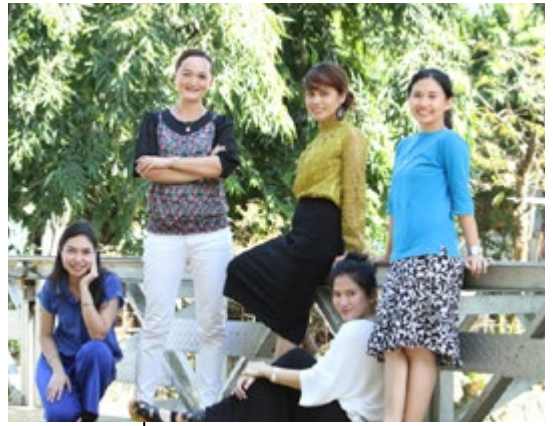
GUTSY Group of the Philippines