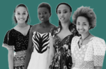
→ Harambee volunteers