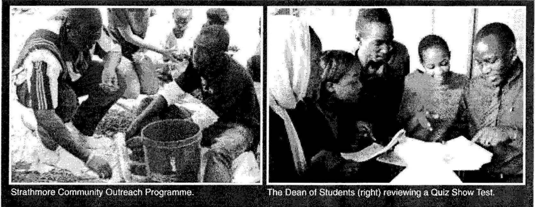
Strathmore Community Outreach Programme.

The MBA is designed for those experienced managers who wish to broaden their knowledge and expertise without interrupting their careers. The emphasis is on applying new tools and ideas in the workplace assuring that both the participants and their companies immediately benefit from a world-class MBA.