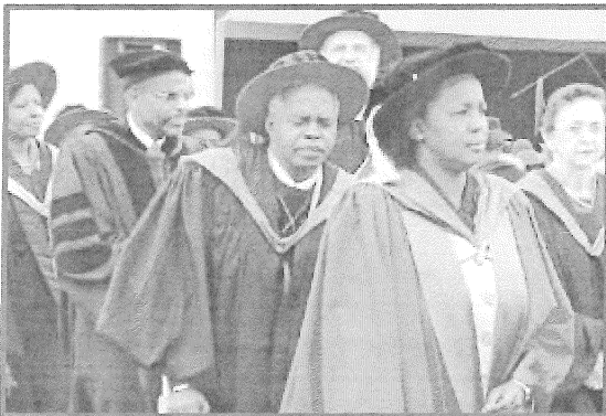
An academic procession at Strathmore

Strathmore University, Oje Sangale Road, Madaraka Estate P.O. Box 59857 00200 Nairobi City Square Tel: (+254-020) 606155 0722-205428, 0733-618135 Fax: (+254-020) 4607498 Email: admissions@strathmore.edu Web site: http://www.strathmore.edu