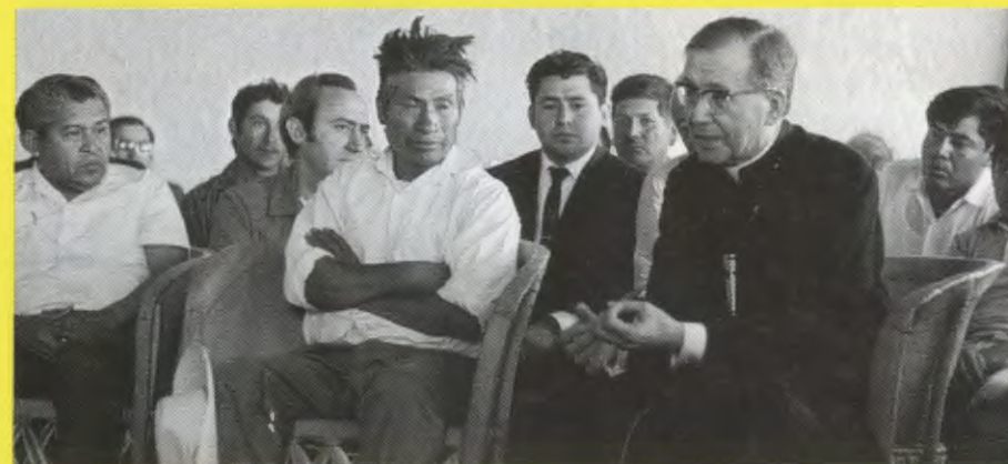
1 Blessed Paul VI & Saint Josemaría in Centro Ellis, a technical school in the suburbs of Rome (1965)