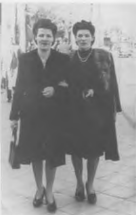
With one of her sisters in Madrid, 1945.

of one. She believed that it is possible to be happy here on earth, by teaching more and more people about caring for the home, which is crucial because that is where people develop their personalities.