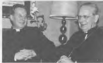
蔡浩偉蒙席與將列品真福的歐華路

為所有的信眾、教會，以及尤其是，我可以說——屬於教會一部份的主業社團，若望保祿二世與若望廿三世都是與我們關係密切的真正父親。我相信他們幫助了無數的人們，讓他們感受到自己是教宗的「鍾愛子女」。