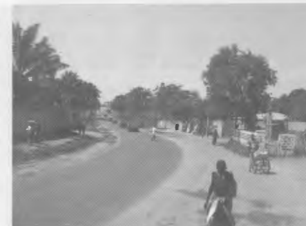
Neighborhood near Monkole

You learn to adapt to it. True, the people express their faith in external gestures, through music and dance, and that is fine, so long as it doesn't impede the more interior dimension of the faith. My experience is that we are mutually enriched and the interchange of traditions and outlooks helps all of us to grow in our faith.