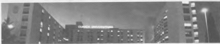
那瓦拉大學醫院 (University Clinic of Navarre)