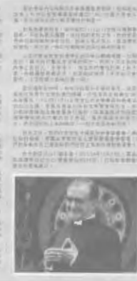
Leaflet in Chinese on the Miraculous Medal that speaks about St. Josemaría's devotion to the Virgin Mary under this title.