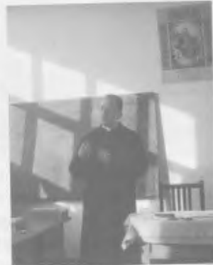
Giving classes to seminarians from the "underground" Church.

I had been wondering how I could explain the meaning of Christmas to him, but it wasn't necessary. His simple but deep words moved me and I thought: "How many people in China don't know you, Jesus." From that moment a great restlessness to go to China was born in my heart.