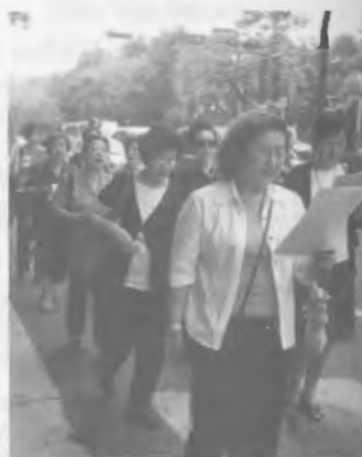
Eucharistic procession with faithful from the parish in Taiwan.

among the persecuted Catholics in China. It's a faith purified by the Cross, by suffering. They've taught me so much. For example, when we celebrated early morning Eucharist in someone's home, the piety of those people was so moving. For them, the Mass is truly a treasure.