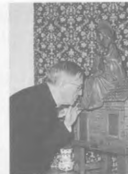
St. Josemaría kissing our Lady of Loreto

few of what you could call set-pieces. The photos show the look of affection on his face, or how attentively he listened to someone who was talking to him... and always that smile of his. Saint Josemaría was joyful all his life because he knew he was a son of God, and he passed on his infectious cheerfulness to the people around him. You could see it in his face, and the photos also show how he passed it on to other people. There's one that I call ‘Bursting out laughing’. He was there with several of his daughters, and when I appeared with my camera he said, “Now we'll have to say cheese!” in such a funny way that everyone burst out laughing.