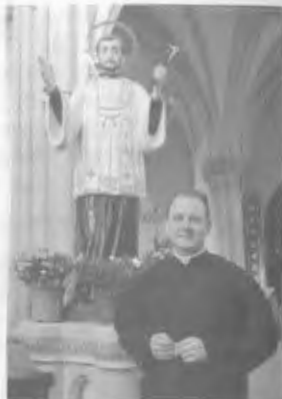
In front of St. Francis Xavier, great missionary to Asia.

After getting to know them, I can say that I've never seen a stronger faith than that