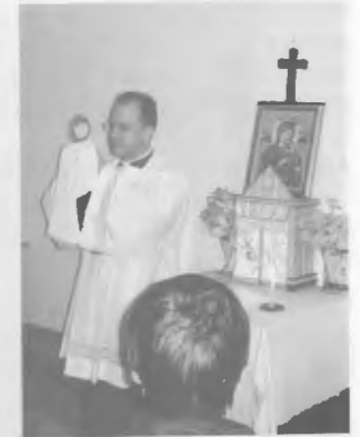
Benediction with the Blessed Sacrament.

In my time there, we had 32 conversions. I recall with special affection a 58-year-old