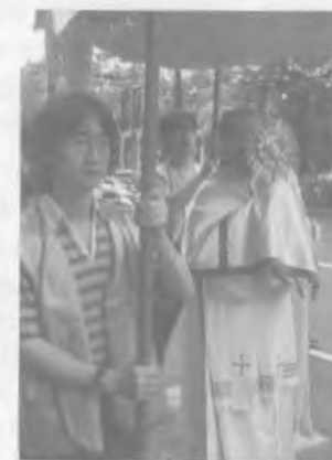
Through the streets of Taipei.