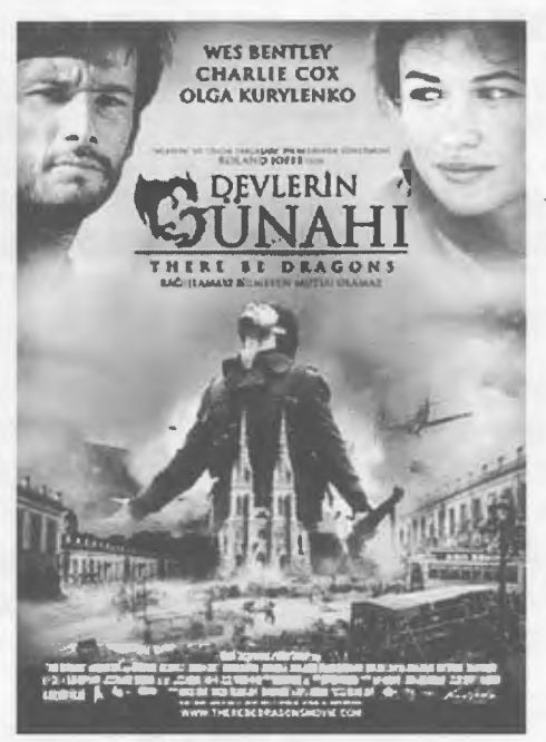
"寬恕就是愛" (There Be Dragons) 海報 土耳其

更多關於觀眾的留言,請看以下網站: http://stjosemaria.org/dragons/index.php?option=com_content&view=article&i d=37&ltemid=118