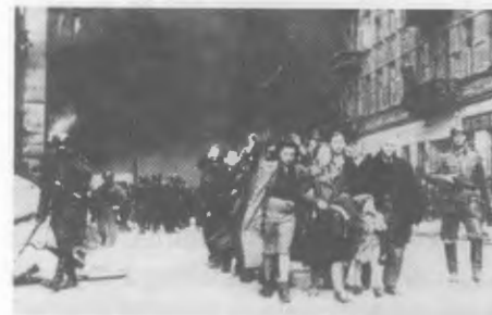
Warsaw during the war

I didn't know anything about St Josemaria; I had never even heard of him. But perhaps he knew me, and that was why he came to meet me in Filtrowa Street, Warsaw, at 11 in the morning on June 26, 2002. That was the moment I opened the gate into the front garden of the house from which, 58 years before (on August 11, 1944) I and my family were sent into exile in the middle of the war.