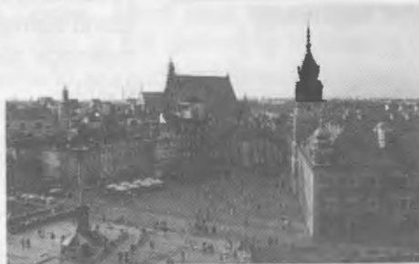
Panoramic view of Warsaw

Until then, June 26, 2002, I still knew nothing about St Josemaria. Just a few months after my discovery, I can boldly say that I already loved him and had absorbed his spirit.