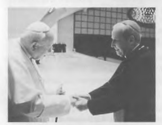
John Paul II observed in an address given in 2002 that "the special mission of the Prelature [converges] with the evangelizing efforts of each particular church."

For now no, but nothing prevents others existing in the future. The Holy See will establish them if they have the formal characteristics proper to this juridical institution as it has been configured by the regulations of the Church.