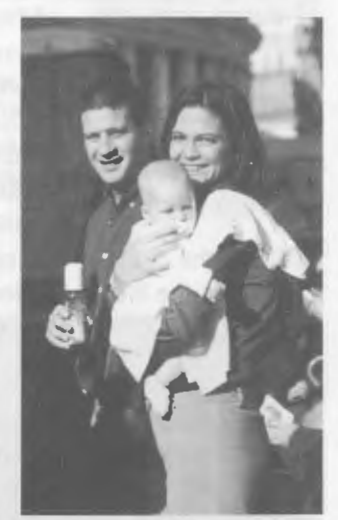
Opus Dei exists to help the apostolate of its lay members in ordinary life

Communion with the Holy See is shown in certain very precise obligations, such as presenting a report on the state of the Prelature every five years, or maintaining regular contacts with the Dicasteries of