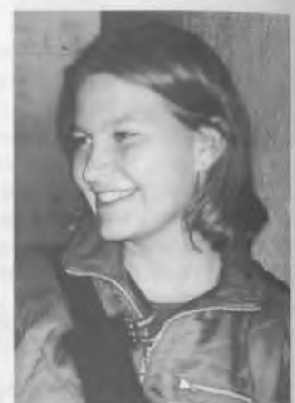
"I've discovered so many beautiful and amazing things, which I had never dreamed of before,"

I was greatly influenced by what I learned at school in this post-Soviet period, both in history and civics courses: about religious wars where the faith was imposed by fire and the sword, about the sale of indulgences, and about the Church and its power structures. And I had almost no other knowledge about the Catholic Church.