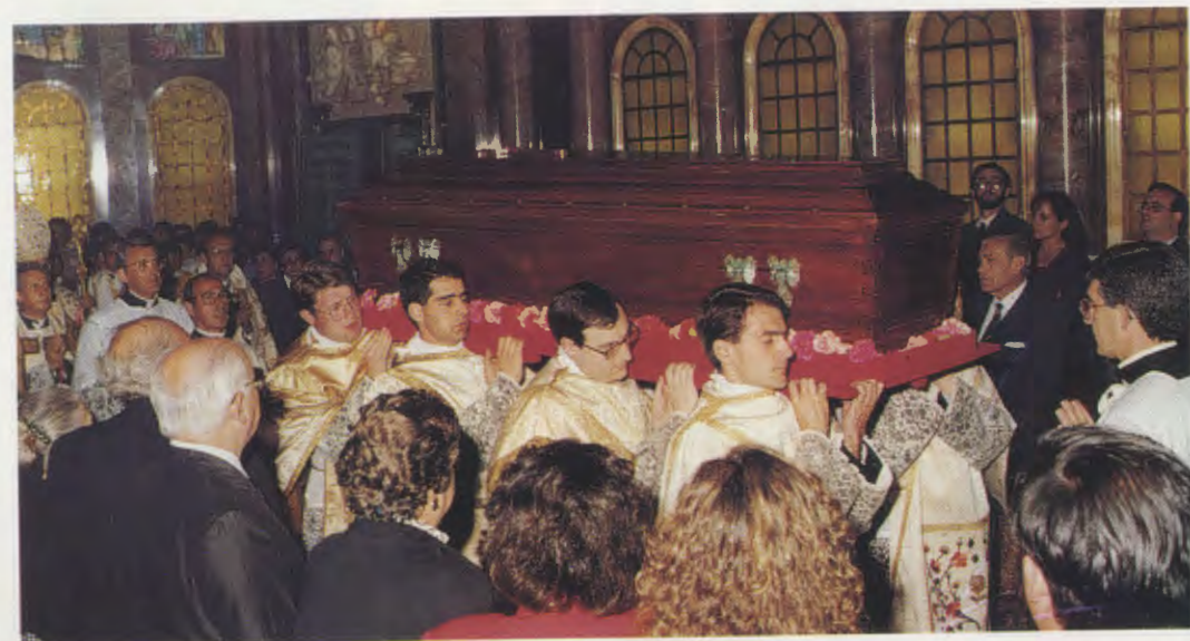
May 21, 1992: Procession in the prelatric church of Our Lady of Peace, where the holy remains of Blessed Josemaría Escrivá rest.

lives of men and women. On May 17, after the beatification, the glass case was uncovered and the coffin could be seen by everyone. Hundreds of Masses, cel-