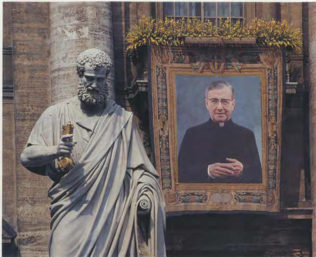
Portrait of Blessed Josemaría Escrivá, displayed on the façade of St. Peter's Basilica, immediately following the Beatification on May 17 and on May 18.