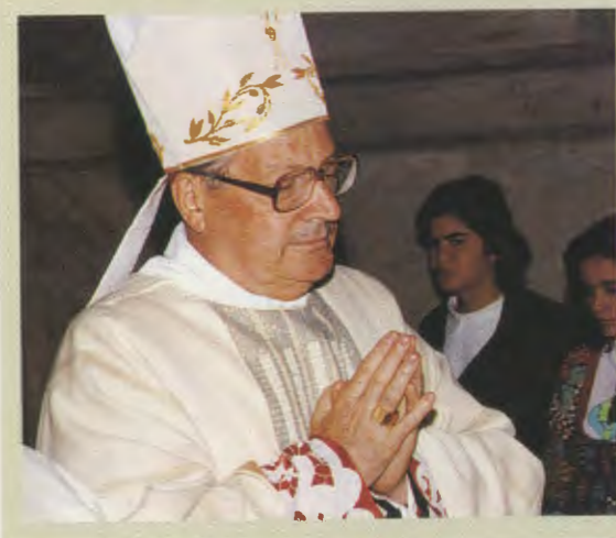
Cardinal Angelo Sodano Secretary of State to His Holiness Basilica of St. Paul Outside the Walls, May 20, 1992

Blessed Josemaría encouraged us always to consider the union with the Roman Pontiff in all its theological depth.