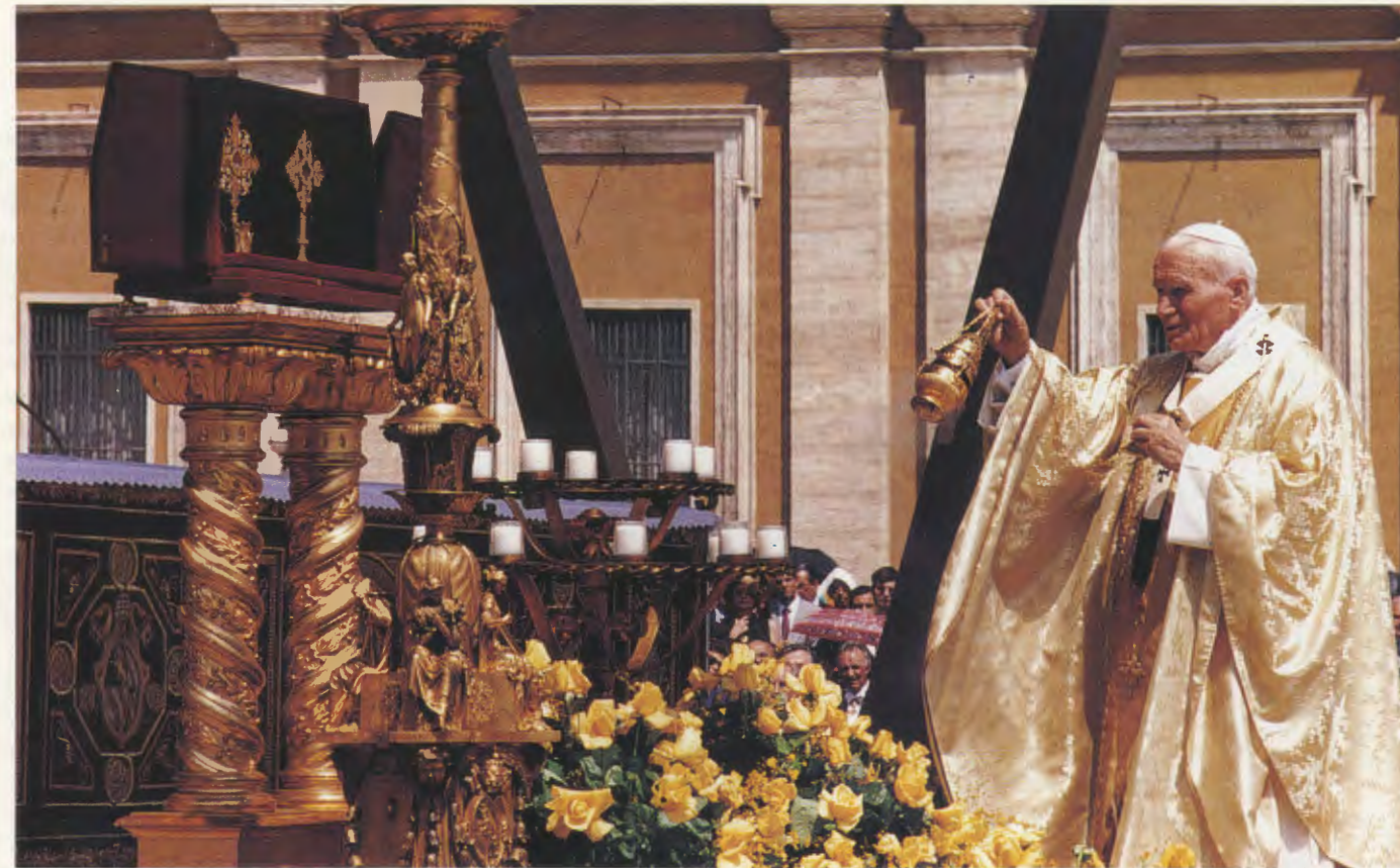
His Holiness Pope John Paul II, during the incensing of the relics of Blessed Josemaría and of Blessed Josephine Bakhita.

"Behold, I make all things new" (Rev 21:5) — says the Lord of glory. The path toward that definitive "newness" of all things passes, here on earth, through the new commandment "that you love one another, even