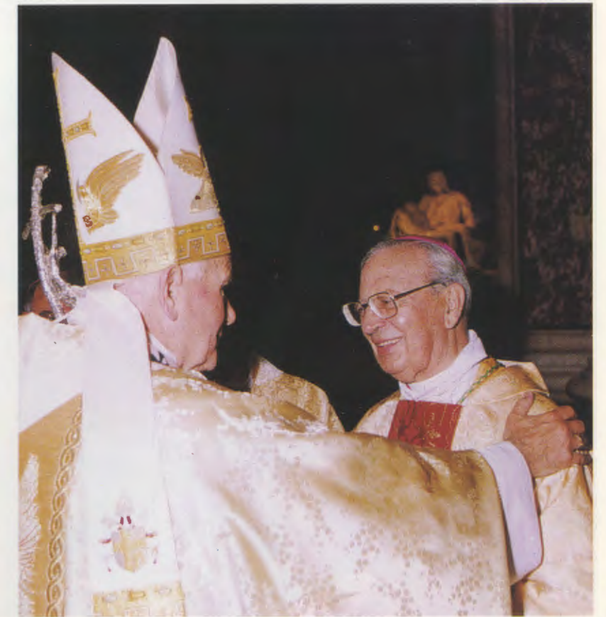
The Holy Father, Pope John Paul II with the Prelate of Opus Dei, Bishop Alvaro del Portillo, on May 17, 1992, after the beatification ceremony.

7. "A new commandment I give to you, that you love one another; even as I have loved you, that you also love one another. By this all men will know that you are my disciples, if you have love for one another" (John 13:34-35). With these words of Jesus the Gospel of today's Mass ends. In this saying we find the summing up of all holiness ; the holiness that Josemaría Escrivá and Josephine Bakhita attained, by paths that were different and yet met in one and the same goal.