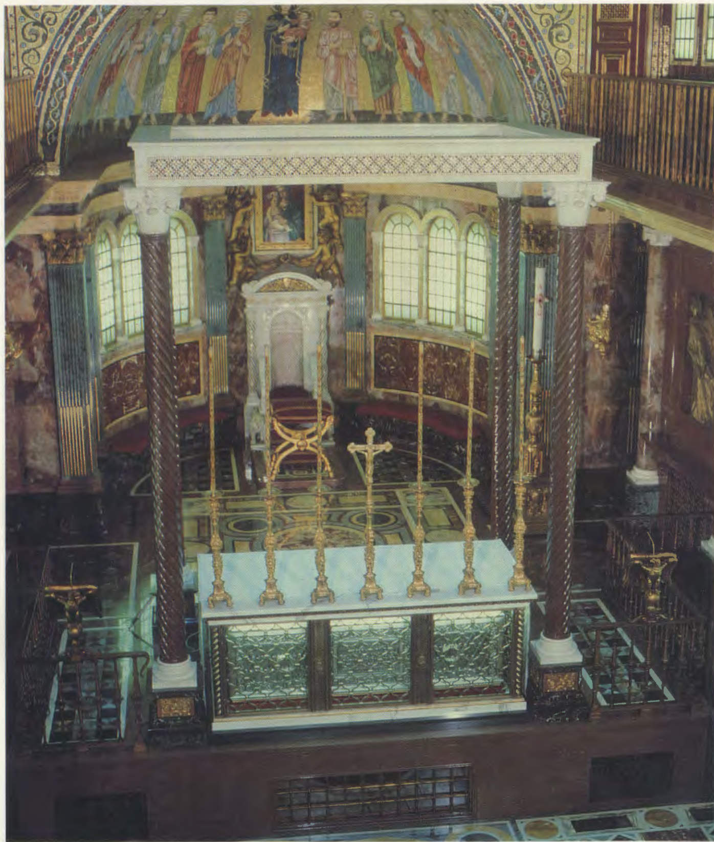
Altar of the prelatial church of Our Lady of Peace, with the casket containing the sacred body of Blessed Josemaria Escriva.