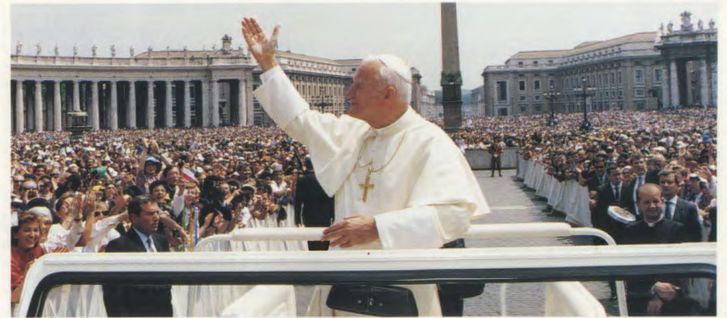
Pope John Paul II, before the Audience of May 18, 1992, being acclaimed by the pilgrims who attended the beatification.