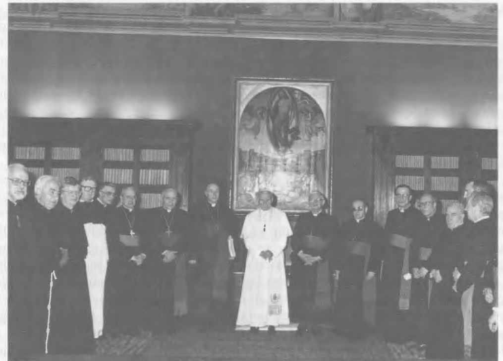
After the reading of the Decree of the heroic virtues of the Venerable Josemaría Escrivá.

The servant of God was born in Barbastro, Spain, on January 9, 1902, of devout and God-fearing parents. At about the age of fifteen he began to notice signs of his vocation.