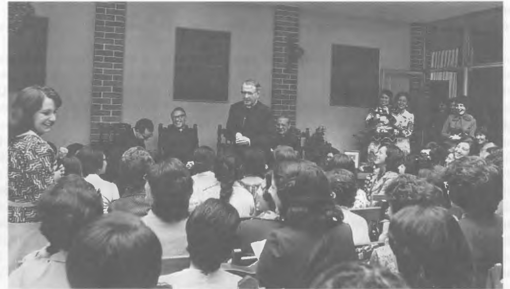
Guatemala, 1975: In a training center for women.

“[Msgr.] Escrivá is a model priest, chosen by God for the sanctification of many souls, humble, prudent, self-sacrificing, docile in the extreme to his Prelate, of gifted intelligence, of very