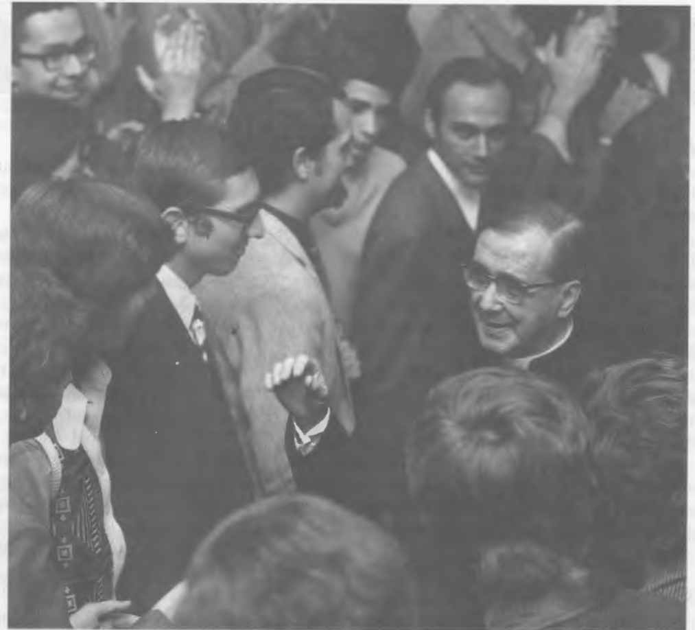
Monsignor Josemaría Escrivá after an informal gathering in Sao Paulo, Brazil, 1974.

Since founding Opus Dei, he gave the Church supreme service; full of love and constancy” (GAP, HRF P-00644, Letter to the Holy Father, Osaka, 7/27/75).