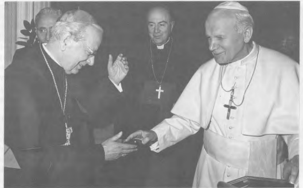
The Holy Father Pope John Paul II with Angelo Cardinal Felici, the Prefect of the Congregation of Saints, and Monsignor Alvaro del Portillo, the Prelate of Opus Dei, after the declaration of the heroic virtues of the Venerable Josemaría Escrivá on April 9, 1990.

In 1946 the Servant of God took up residence in Rome. In 1947 and 1950 he obtained Opus Dei's approval as an institution of pontifical right. With tireless charity and active hope he guided the development of Opus Dei throughout the world promoting a vast mobilization of lay people who became aware of their personal responsibility in the Church's mission. He gave life to numerous initiatives in the work of evangelization and human welfare. Everywhere he fostered vocations to the priesthood and to the religious life. He carried out exhausting journeys through Europe and America proclaiming the Church's teaching with most vigorous faith. Above all he devoted himself tirelessly to the task of forming the members of Opus Dei – priests and laity, men and women – so that they would acquire a solid spiritual life, an exemplary adherence to the Church's magisterium, and an ardent zeal for souls expressed in a personal commitment to carry out a far-reaching apostolate. Omnes cum Petro ad Iesum per Mariam! "All with Peter to Jesus through