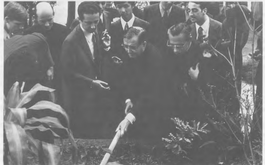
Monsignor Josemaría Escrivá in Sitio de Aroeira, a center of Opus Dei in Brazil, 1974.

“All who had the privilege of knowing him can testify that when he died in 1975, at the age of 73, he was so young! He had not grown old with the passage of time. On the contrary, his spirit had grown younger year by year, with an incredible vitality of youthfulness and cheerfulness born in no easy fashion but over a lifetime of heroic struggle which brought him closer to God day by day” ( Opus Dei in Africa: a Force for Good , in the Sunday Nation , Nairobi, 2/3/80).