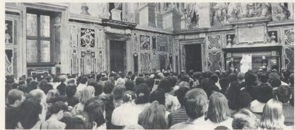
Rome, 14 October 1993. The Holy Father, Pope John Paul II, spoke to those taking part in the Theological Study Convention on the Teaching of Blessed Josemaría Escrivá

On 14 October the 500 participants in the Convention were received in audience by His Holiness John Paul II. The Holy Father addressed them as follows.