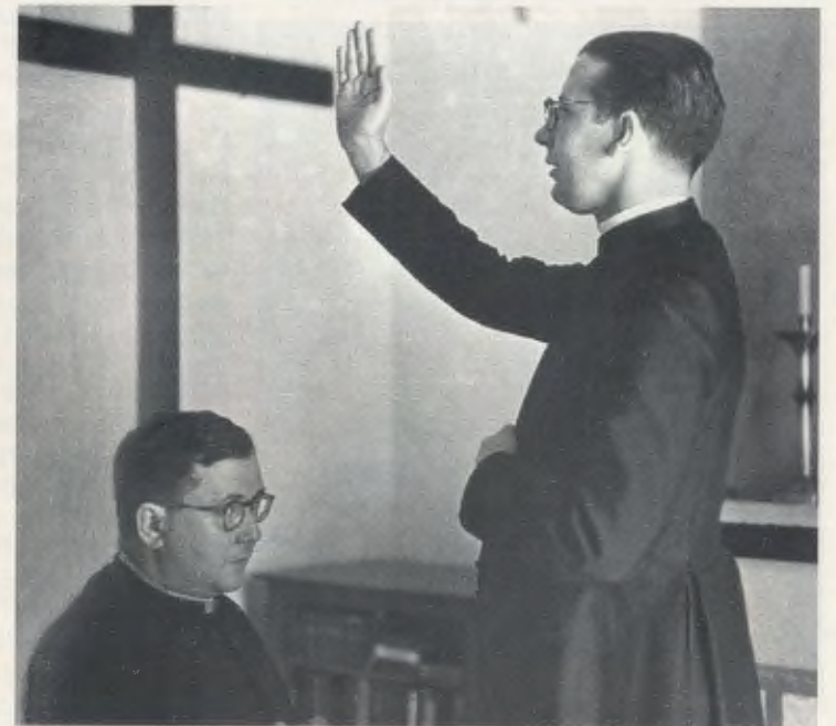
The newly ordained Fr Alvaro del Portillo gives his blessing to Blessed Josemaría Escrivá, on 26 June 1944.

The three candidates gradually completed their examinations and approached the end of their studies. The tonsure ceremony took place on 20 May; on subsequent dates