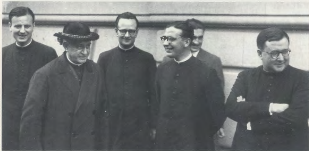
The Founder of Opus Dei accompanied by the Bishop of Madrid and the first three of his sons to be ordained, on 25 June 1944.

T he Founder wanted to give the Liturgy and Pastoral Theology classes himself. Besides engraving on their hearts a love and respect for the liturgical regulations, which he taught them to observe with deep piety, the Father passed on to them, by means of clear and wise counsels, his own wide-rang-