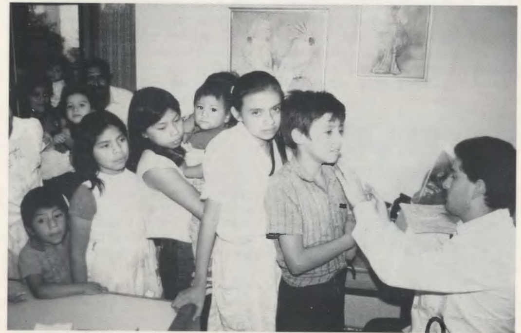
Vaccination programme in the Kinal out-patients' clinic.

Not for nothing was the sanctification of work one of the lessons he taught us during his stay in Guatemala. In one of his get-togethers with a large audience from all over Central America, someone asked him about St Joseph. Blessed Josemaría Escrivá answered, "I venerate him with all my soul, and I always call him my Father and my Lord; and I add, 'whom I love so much!' I do love him very much. He teaches us the value of ordinary work, which is the human means to holiness that we have within our reach: doing the ordinary things of every day, of every hour, of every minute, with love. Whether or not we feel like it, but with love and affection. Whether or not we feel like it, but as well as we possibly can. Whether or not we feel like it, but in a way that can be offered to God our Lord. It doesn't matter whether we are building a skyscraper or making a wicker basket. I