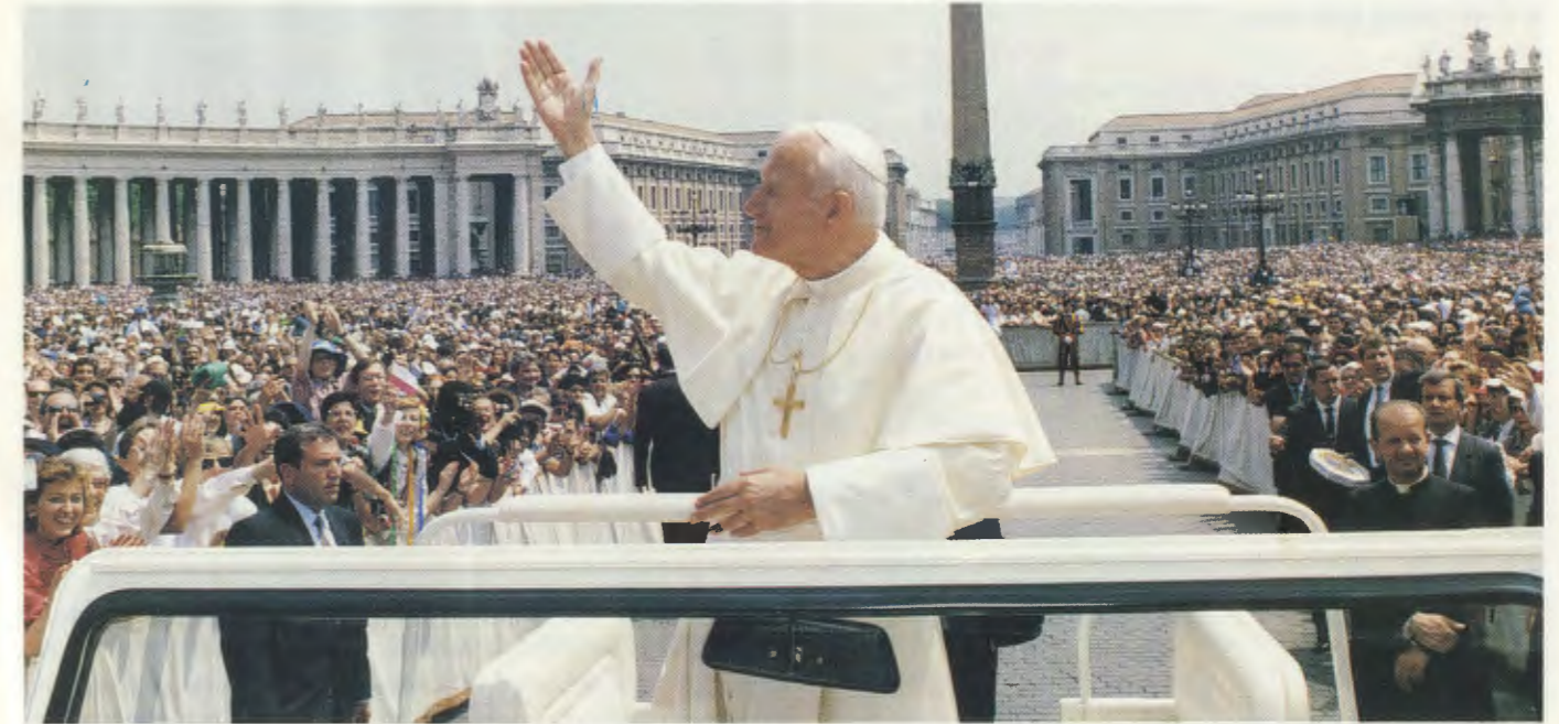
Pope John Paul II before the audience of May 18, 1992, being acclaimed by the pilgrims.