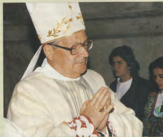
Cardinal Angelo Sodano Secretary of State to His Holiness

Holy Father, on this day when, through a happy coincidence, we are celebrating Your Holiness' seventy-second birthday, and renewing my full personal adhesion and that of all of the Prelature of Opus Dei to the Holy See, allow me to offer you our congratulations with the classical Latin expression, which I would like to be an invocation to Our Lord and His Most Blessed Mother: ad multos annos! Then, after thanking Your Holiness once again from the bottom of my heart, I ask, for me and for all those who are joyfully taking part in the beatification of Josemaria Escriva, to be strengthened by your Apostolic Blessing. □