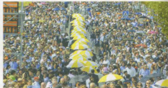
Yellow and white umbrellas marking out and sheltering priests giving Holy Communion