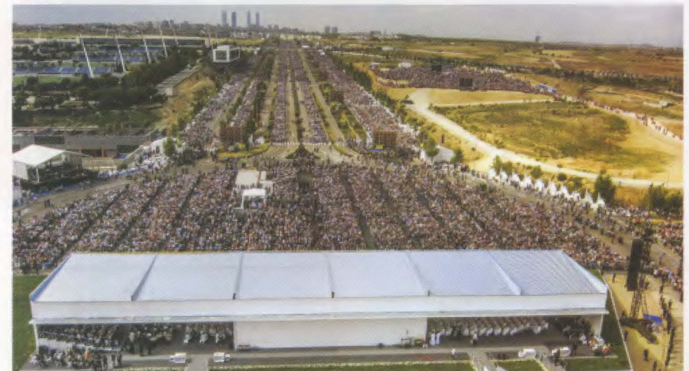
An aerial view of the altar and the faithful attending the beatification

In the first place, Thank you. This is the soul's immediate, spontaneous reaction on experiencing God's goodness. It cannot be otherwise. He always goes ahead of us. However hard we try, his love always gets there first, touches and caresses us first, He beats us to it. Álvaro del Portillo was aware of the many gifts God had given him, and thanked God for that manifestation of his fatherly love. But he did not stop at that: his recognition of Our Lord's love awakened in his heart desires to follow him with greater commitment and generosity, and to lead a life of humble service to others. Especially outstanding was his love for the Church, the Spouse of Christ, whom he served with a heart devoid of worldly self-interest, far from discord, welcoming towards everyone and always seeking in others what was positive, what united, what was constructive. He never spoke a word of complaint or criticism, even at especially difficult