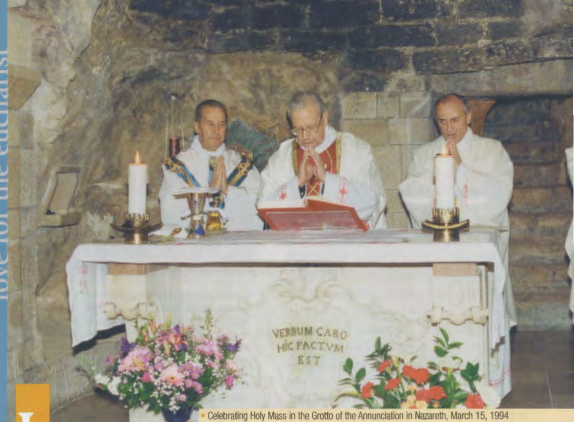
• Celebrating Holy Mass in the Grotto of the Annunciation in Nazareth, March 15, 1994