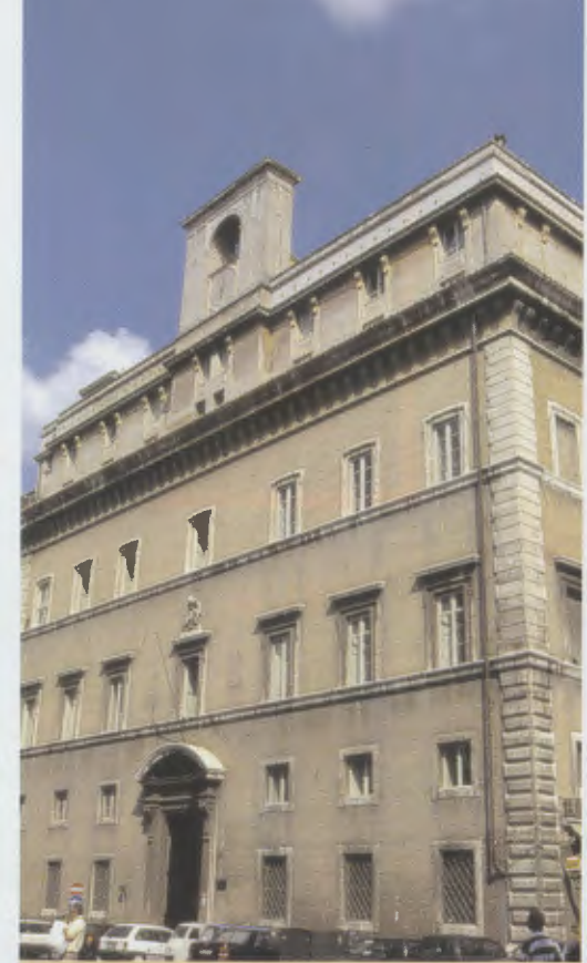
• The Apollinare Palace seat of the Holy Cross Pontifical University.

"Without their help, great or small, which is always the fruit of love for God and veneration for the priesthood, we would not be able to carry out the good that is being done in the service of the Church," Bishop Javier Echevarría, Prelate of Opus Dei, said recently in regard to those who assist the university financially.